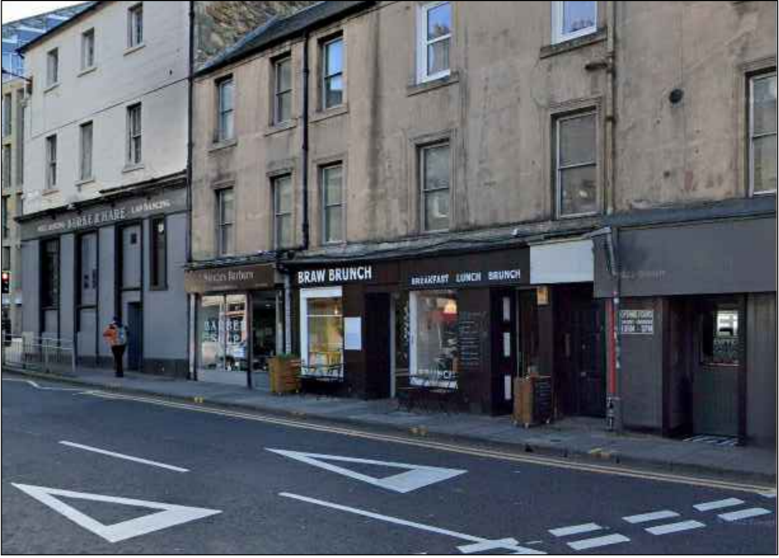
PHOTOGRAPH PROPOSED STREET ELEVATION