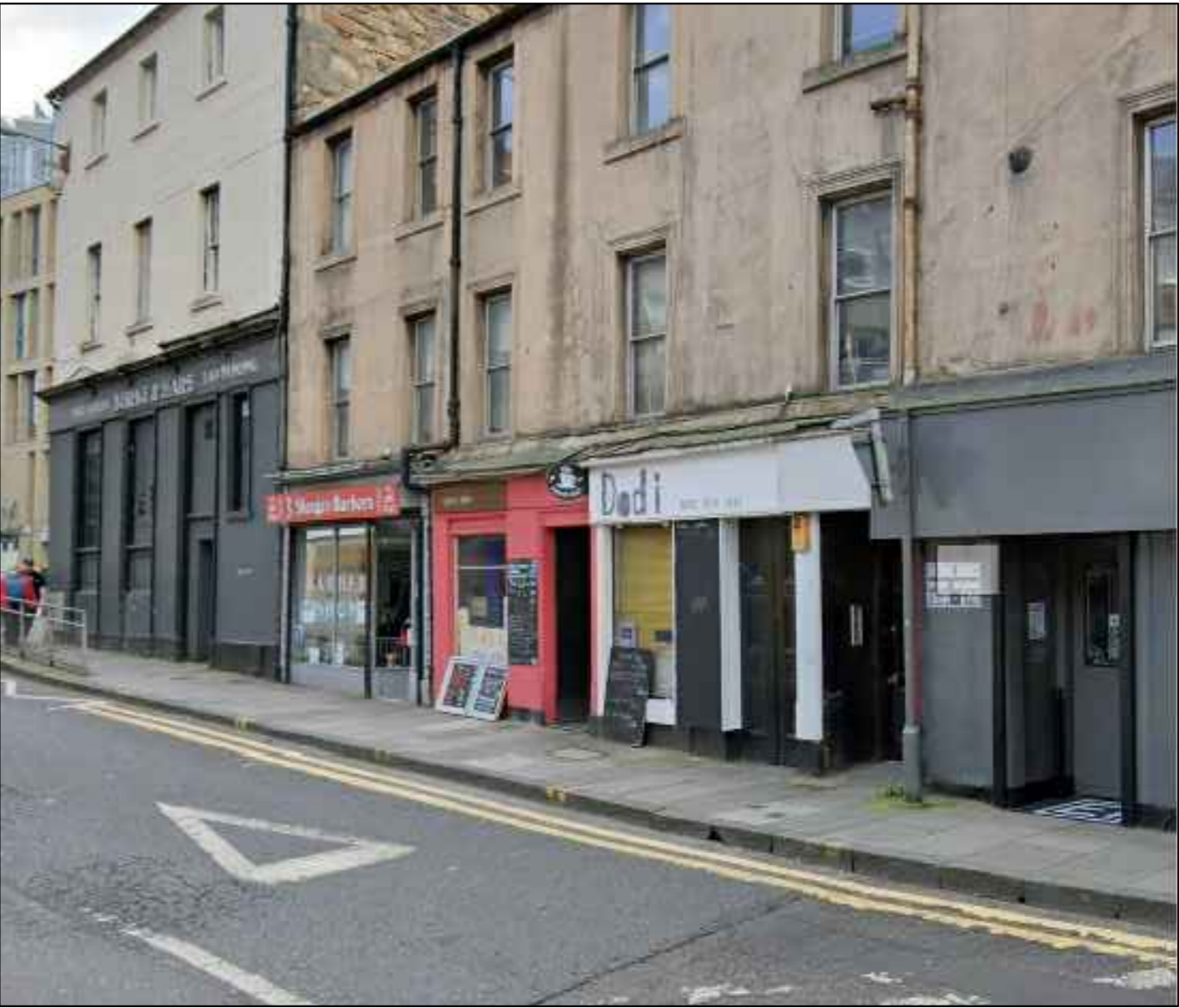
PHOTOGRAPH EXISTING STREET ELEVATION