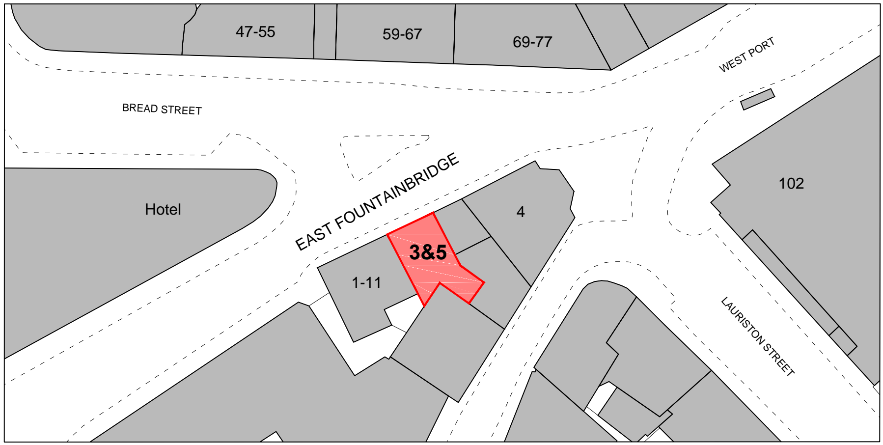
3 & 5 East Fountainbridge, Edinburgh, EH3 9BH