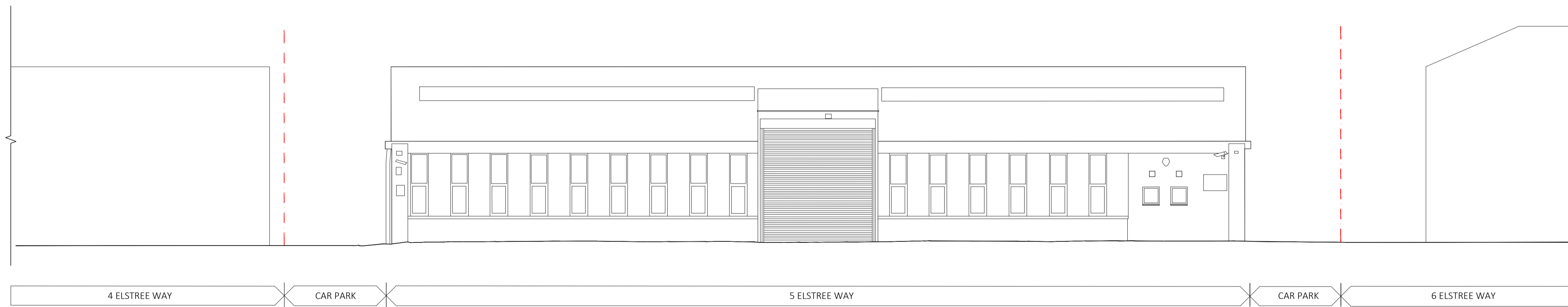
02 SOUTH ELEVATION EXISTING