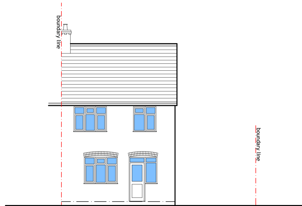
existing rear elevation