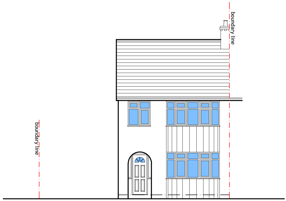
existing front elevation