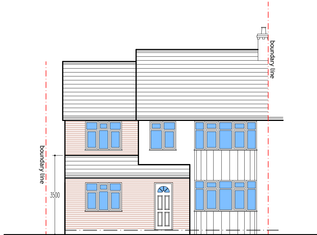
proposed front elevation