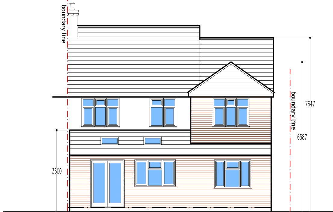
proposed rear elevation