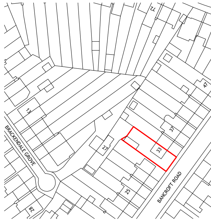
location plan scale 1:1250