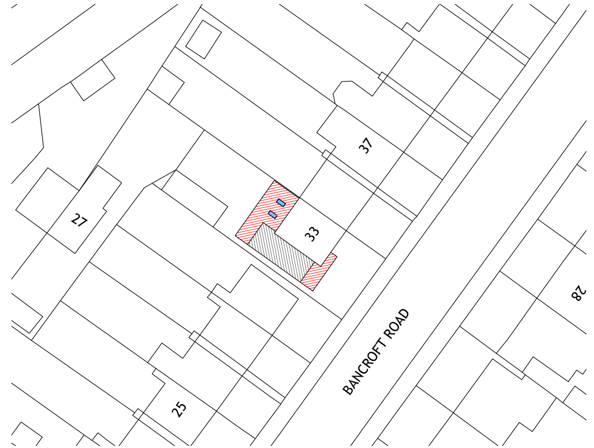
block plan scale 1:500