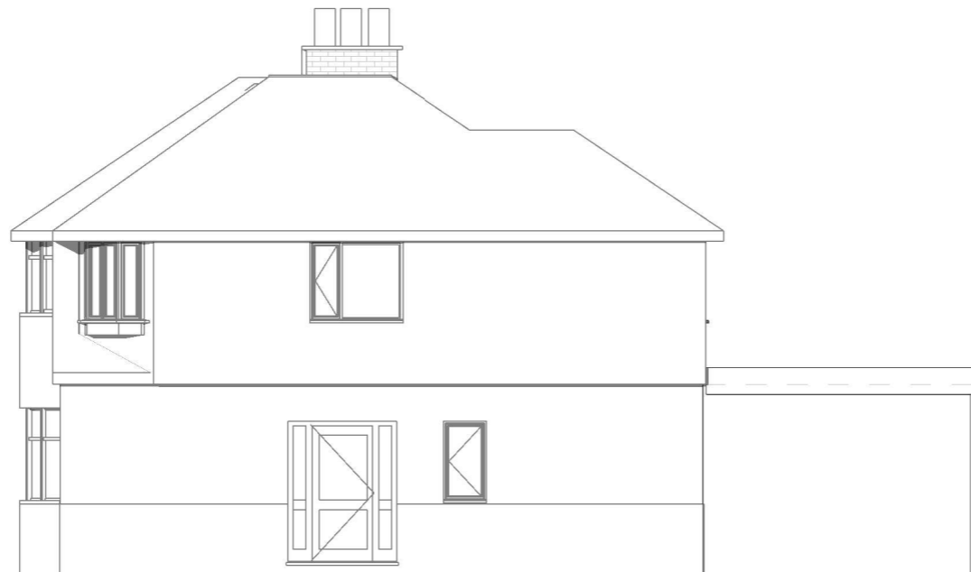
3 Side Proposed 1 : 100

12. Site surroundings. The site is surrounded by other domestic properties.