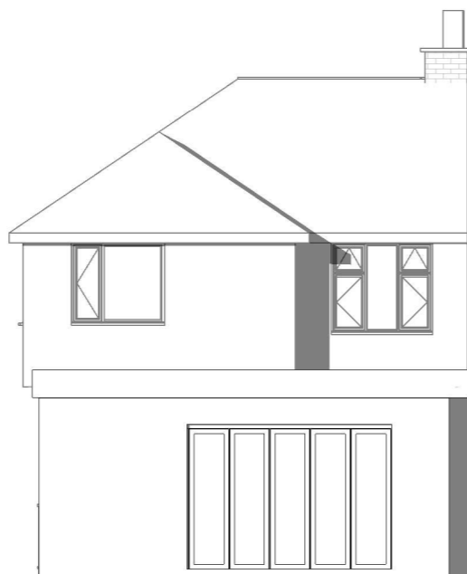
2 Rear Proposed 1 : 100