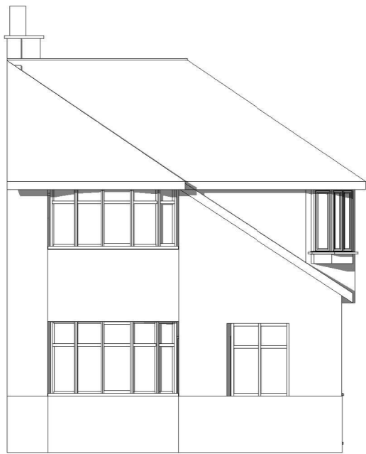
1 Front Existing 1 : 100