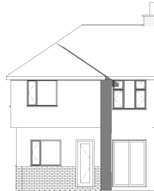
2 Rear Existing 1 : 100