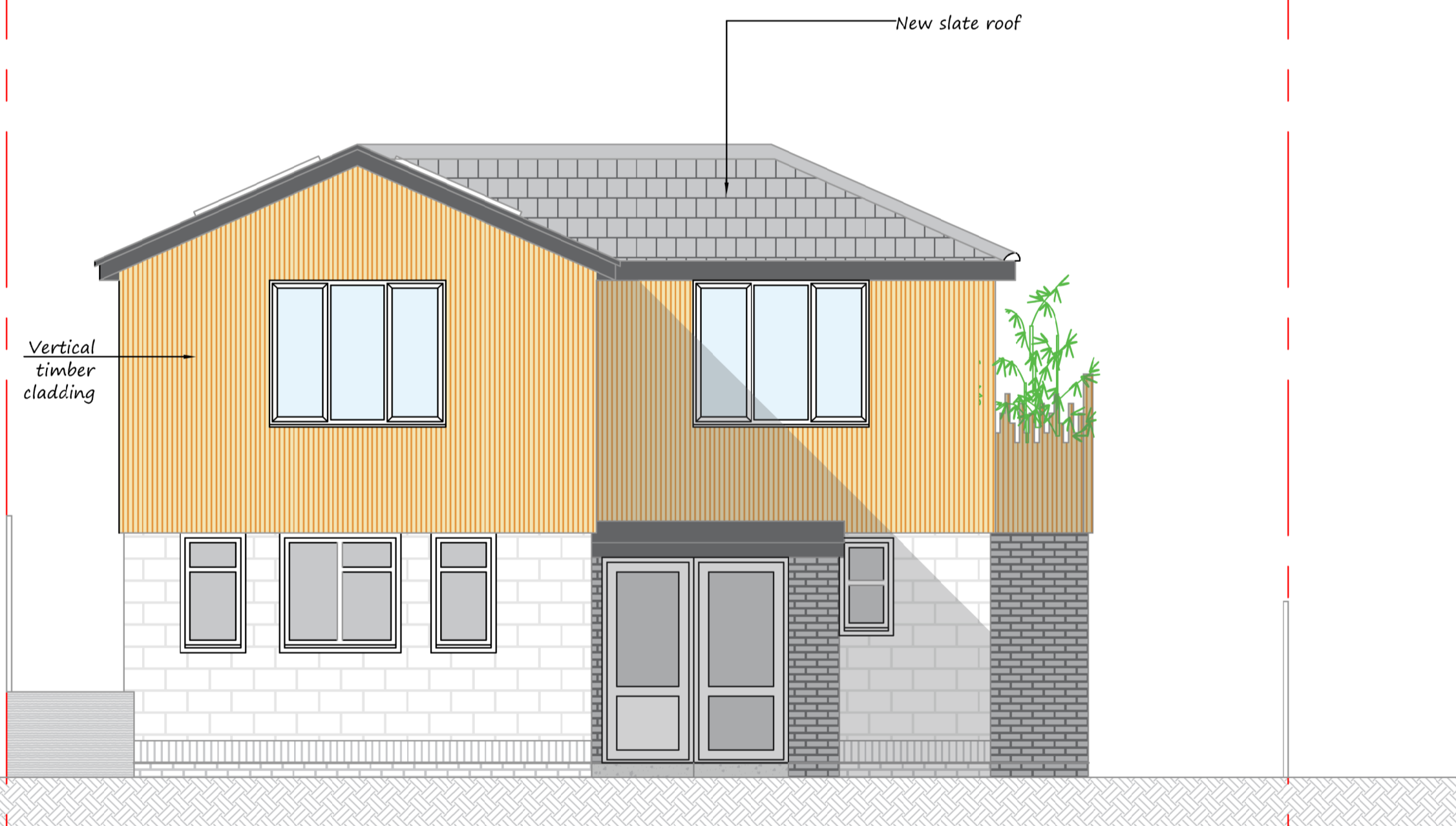
Proposed South Elevation @ 1:50