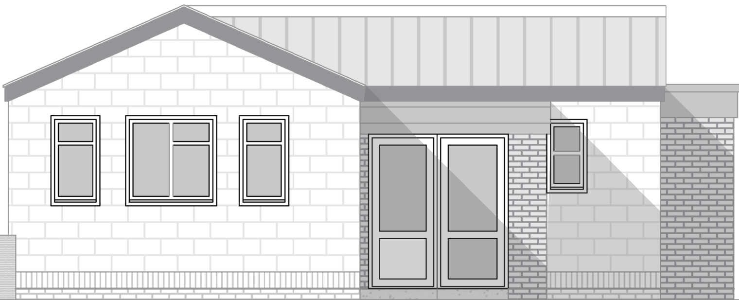
Existing South Elevation @ 1:50