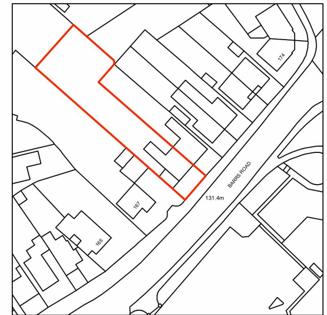
OS MAP Scale 1:1250

All cutting shall be done in the premises with one member of staff who lives at 168 Barrs Road