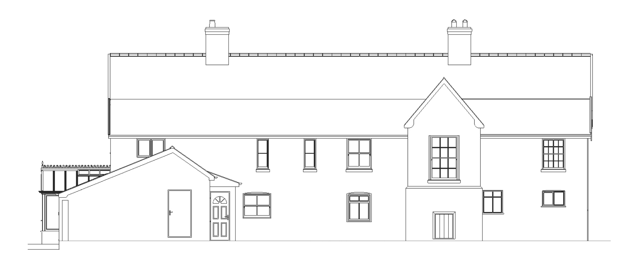
Rear Elevation Existing