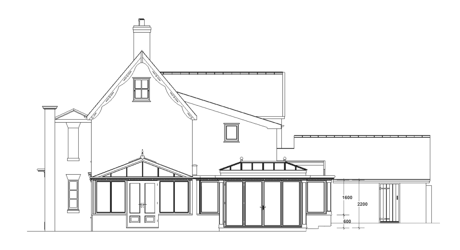
Right Elevation Proposed