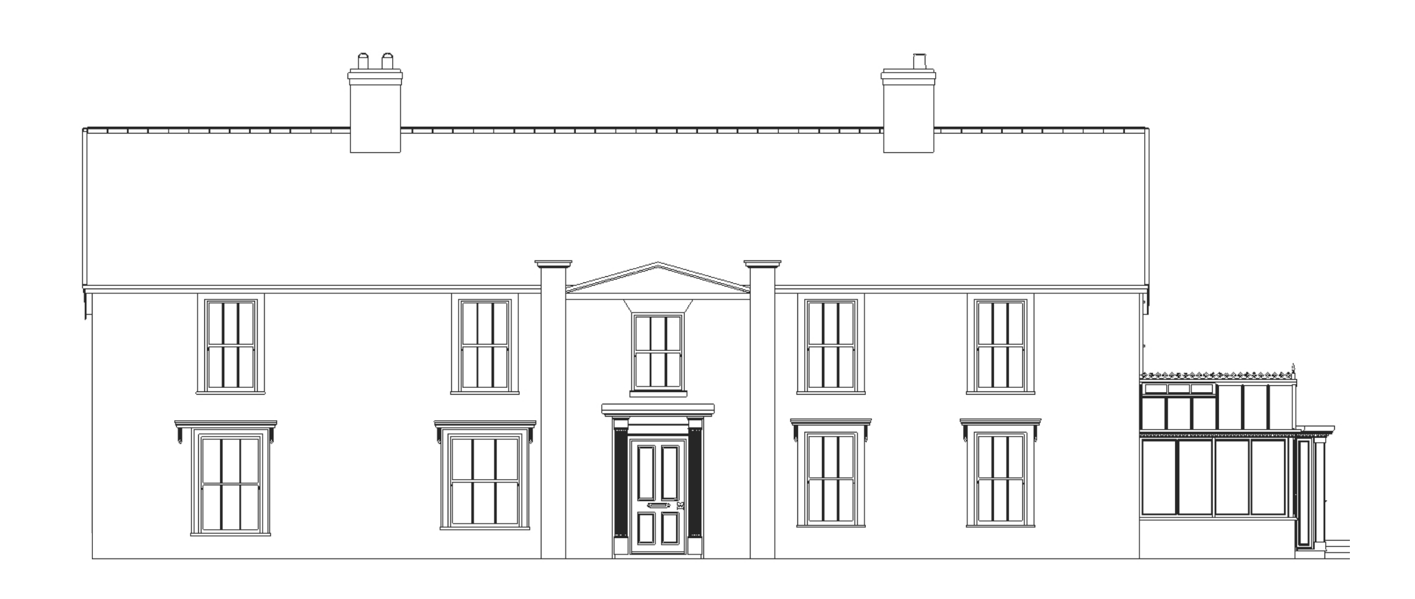
Front Elevation Proposed