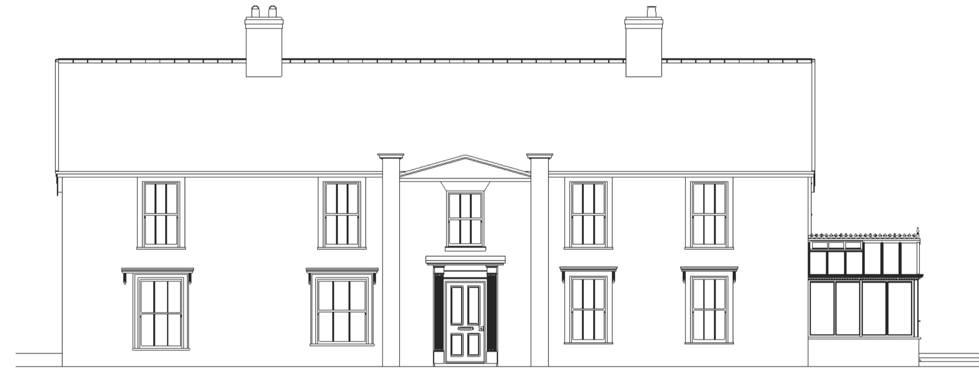
Front Elevation Existing