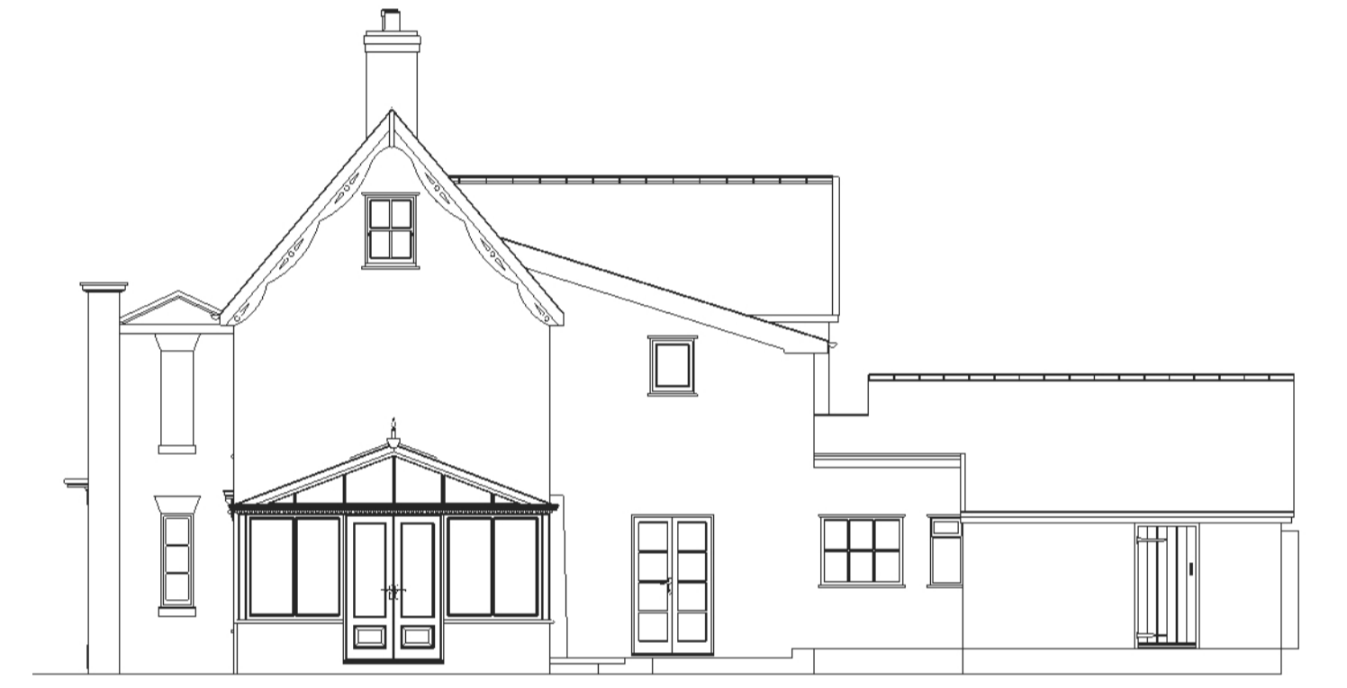
Right Elevation Existing