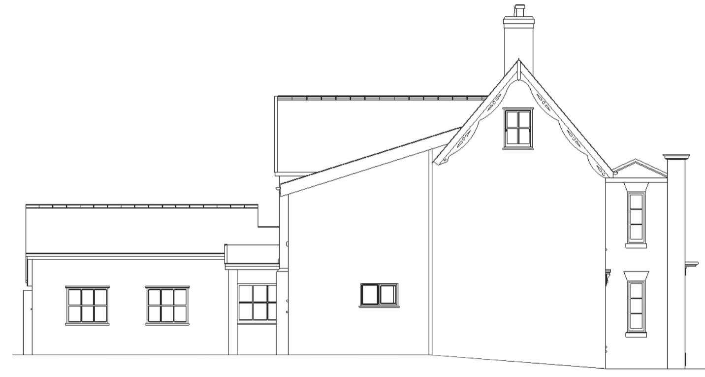
Left Elevation Existing