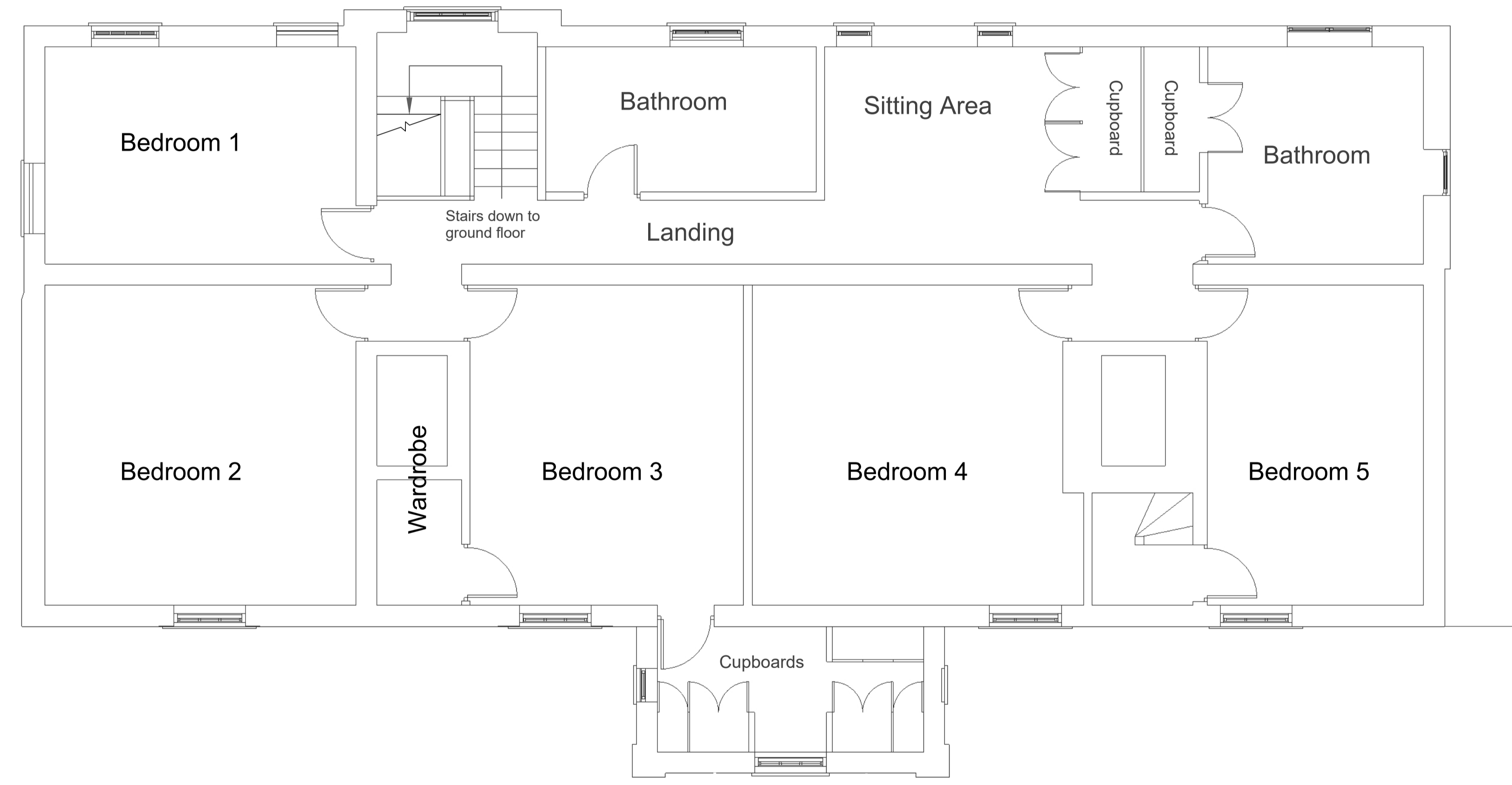
First Floor Plan Existing