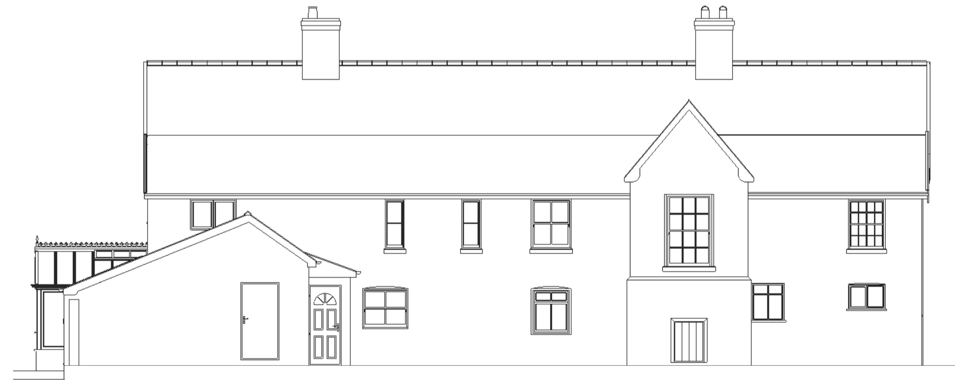
Rear Elevation Existing