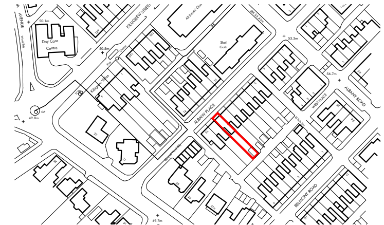
SITE LOCATION PLAN Scale 1:2500