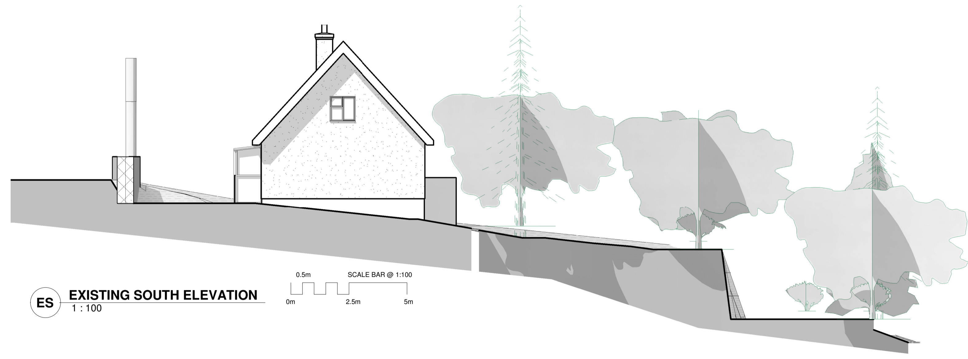
ES EXISTING SOUTH ELEVATION 1:100 0m 2.5m 5m SCALE BAR @ 1:100