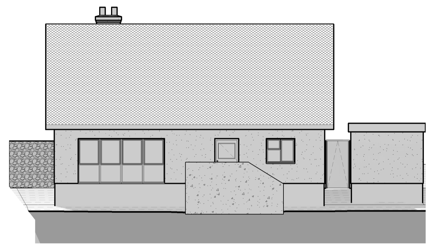
EE EXISTING EAST ELEVATION 1:100 0m 2.5m 5m SCALE BAR @ 1:100