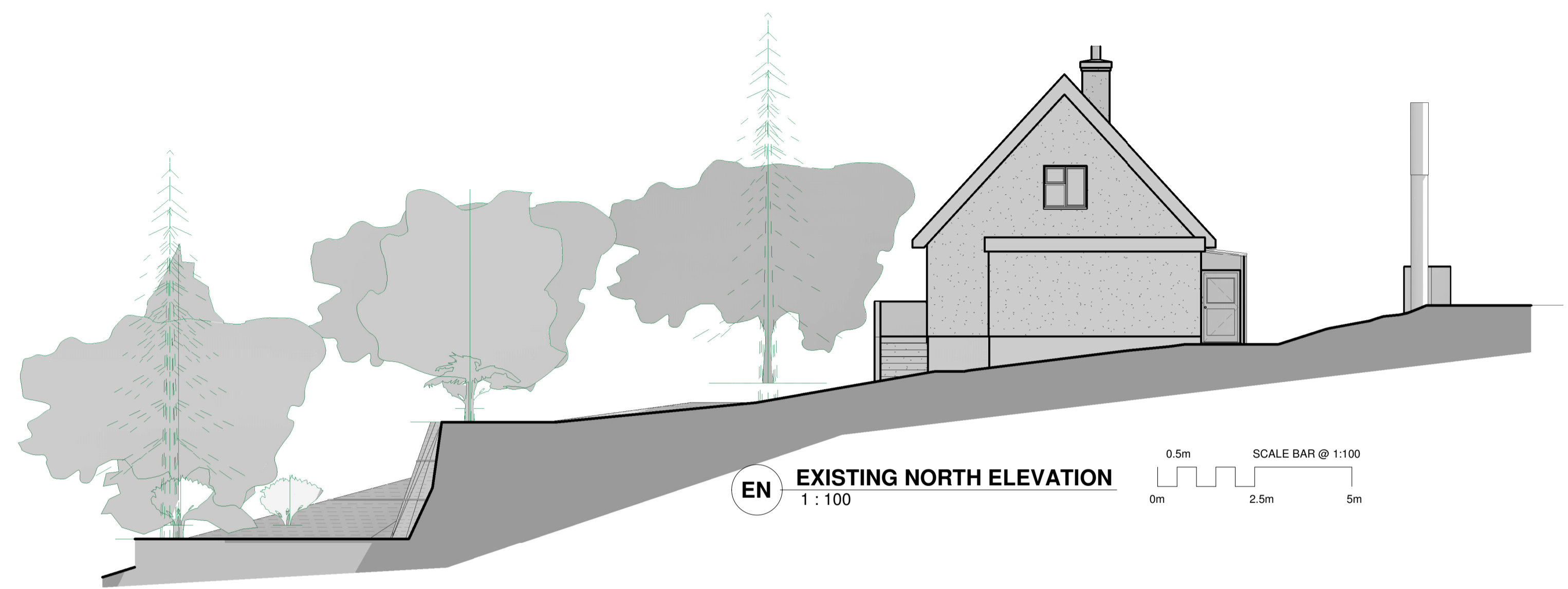
EN EXISTING NORTH ELEVATION 1:100 0m 2.5m 5m SCALE BAR @ 1:100