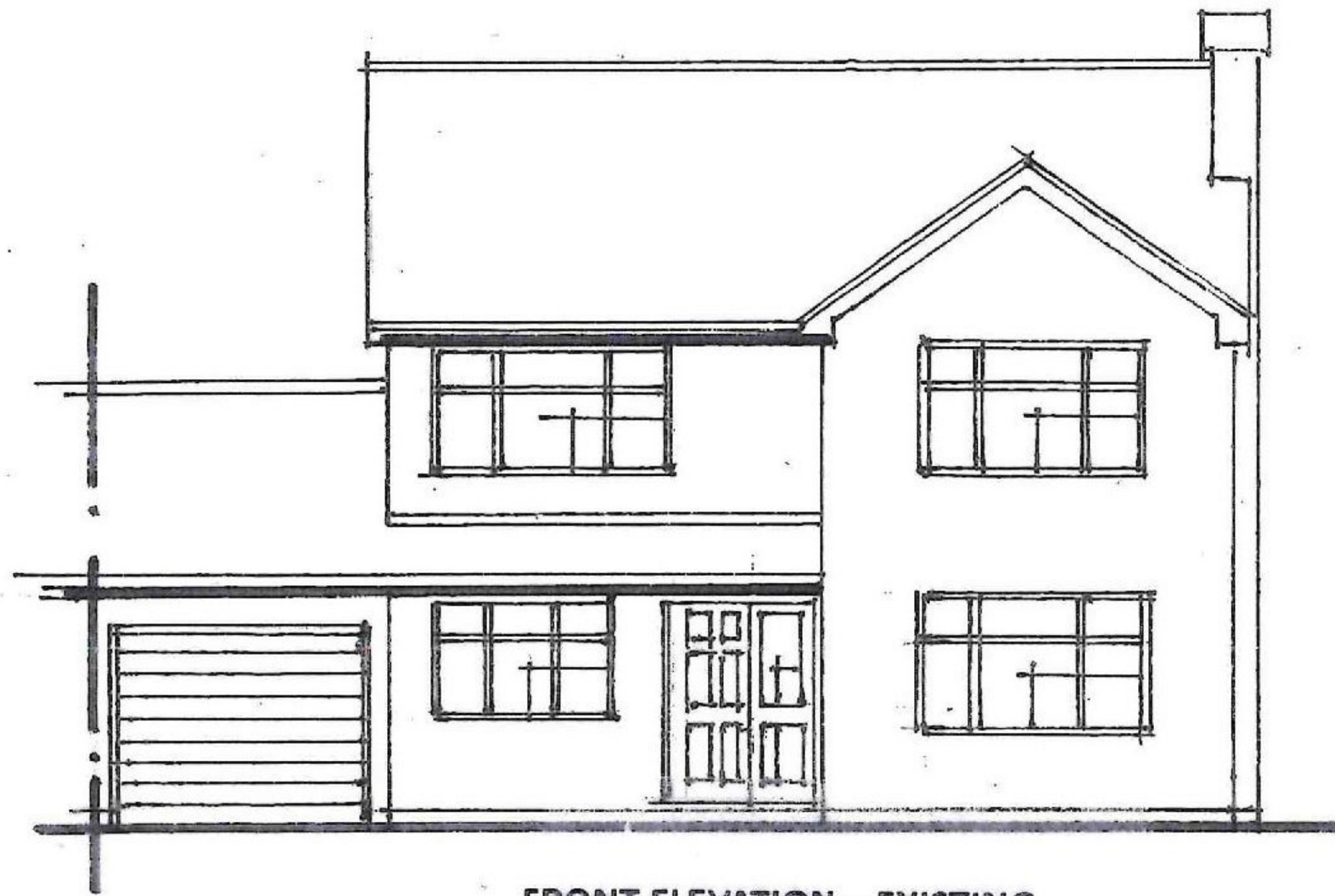
FRONT ELEVATION - EXISTING