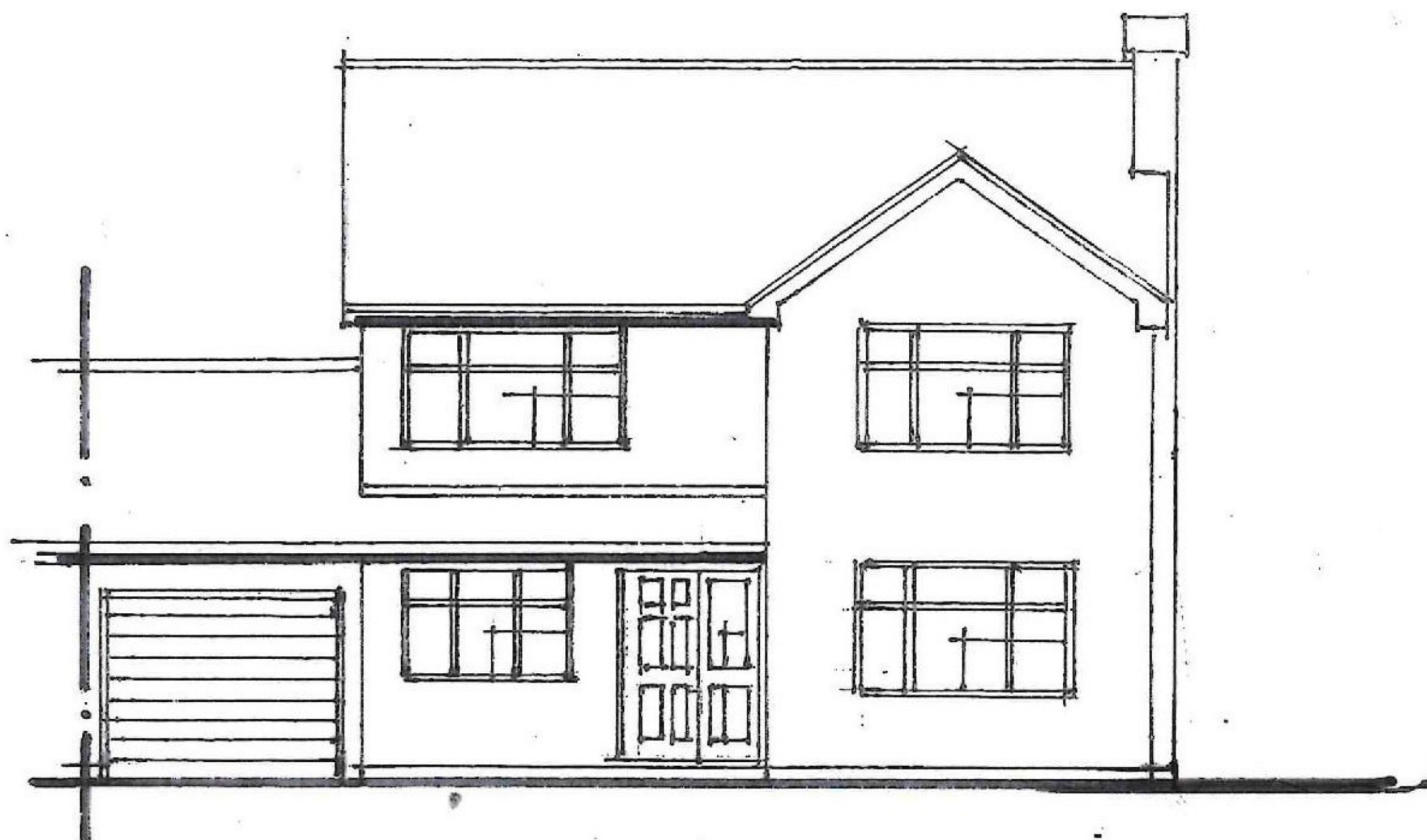
FRONT ELEVATION - PROPOSED