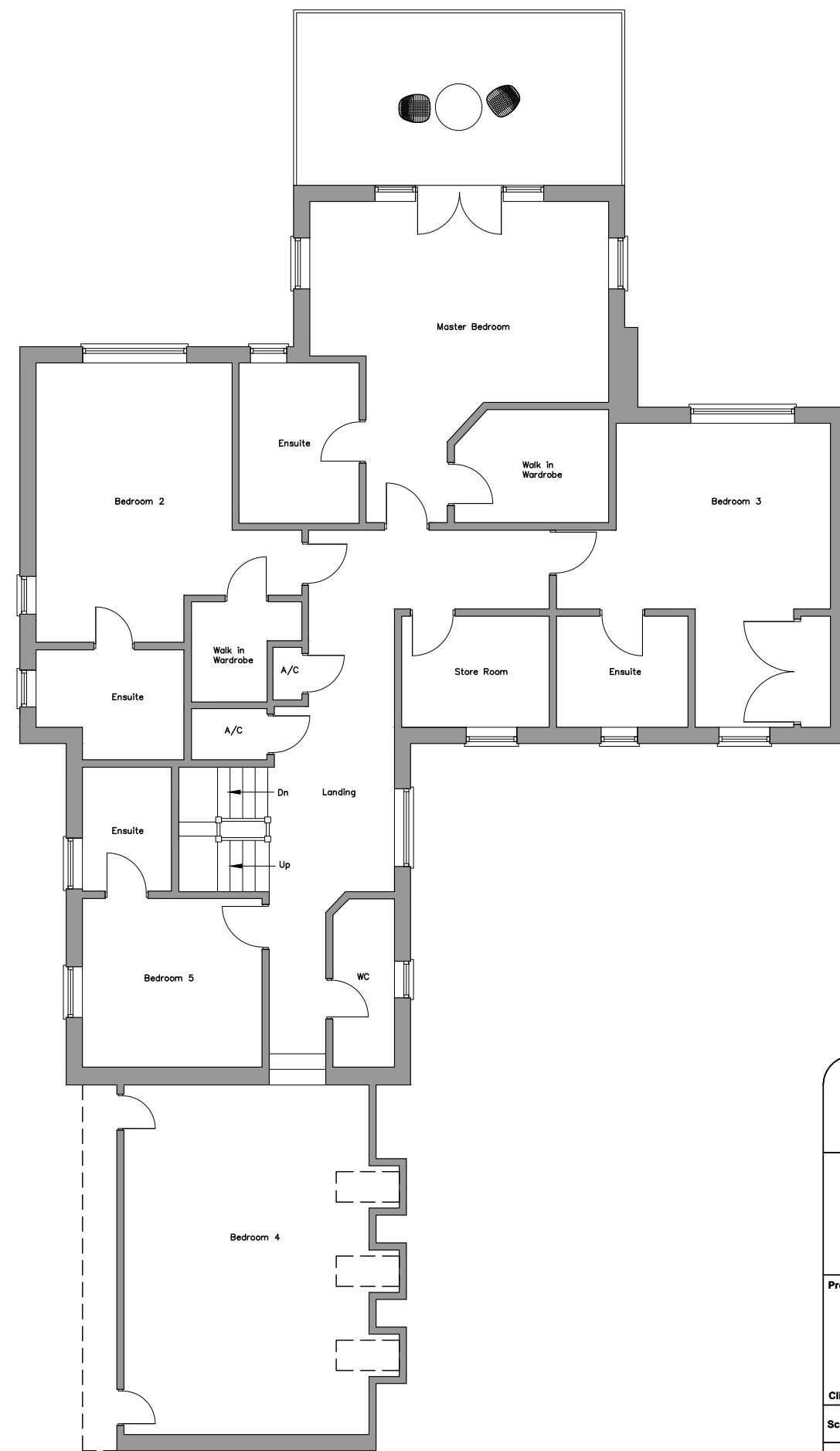
EXISTING & PROPOSED FIRST FLOOR PLAN