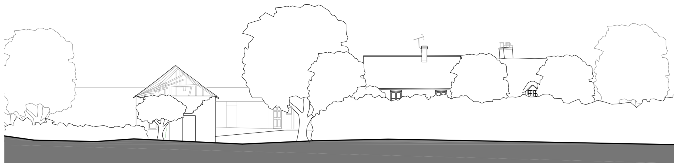
EXISTING CONTEXT ELEVATION (B-B) SALISBURY ROAD SCALE 1:200 @ A2