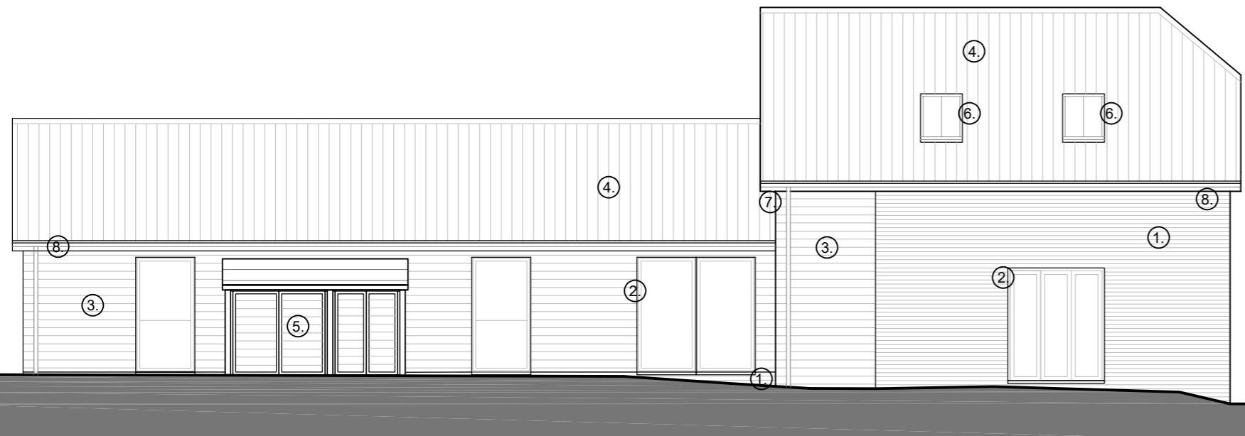
PROPOSED SOUTH ELEVATION BARN CONVERSION - UNIT 5 & 6 SCALE 1:100 @ A3