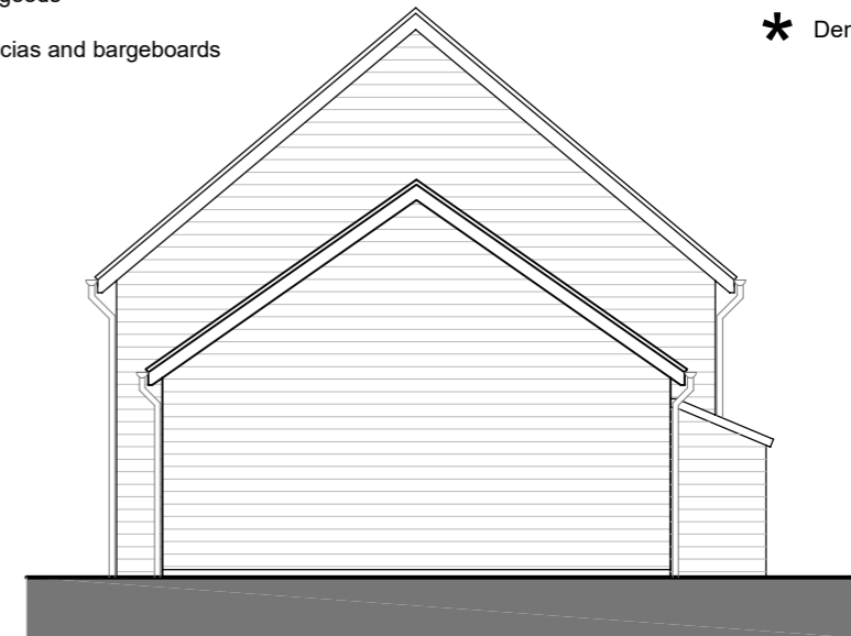
PROPOSED WEST ELEVATION BARN CONVERSION - UNIT 5 SCALE 1:100 @ A3