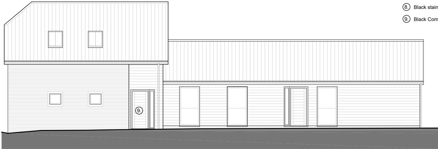
PROPOSED NORTH ELEVATION BARN CONVERSION - UNIT 5 & 6 SCALE 1:100 @ A3