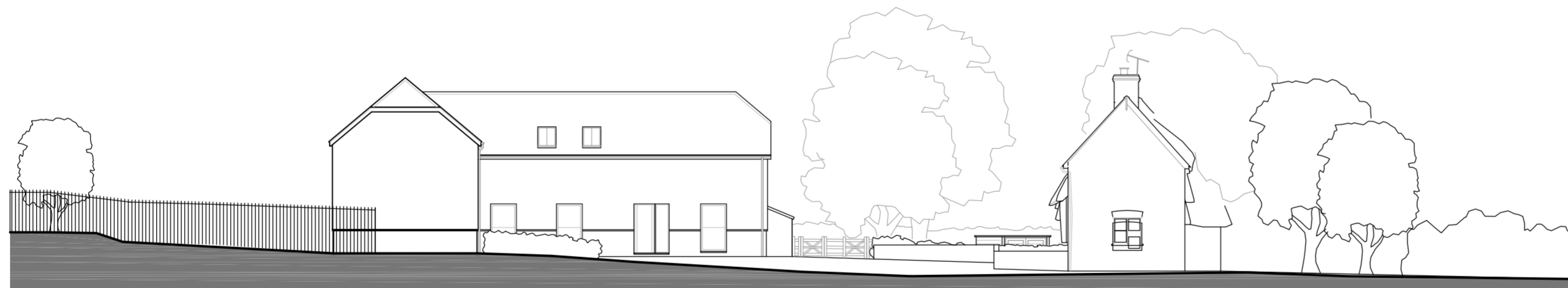
PROPOSED SITE SECTION (A-A) SCALE 1:200 @ A2