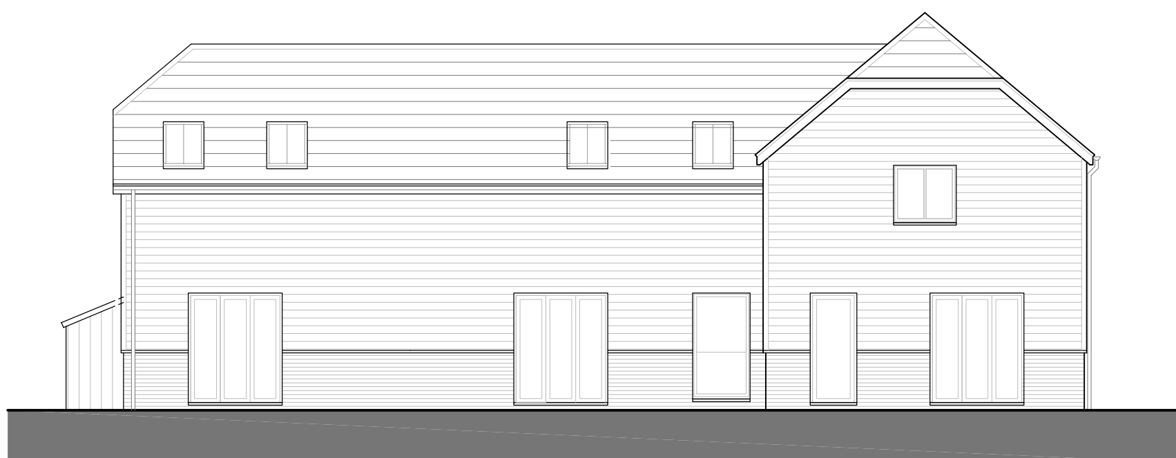
PROPOSED NORTH ELEVATION UNITS 2, 3 & 4 SCALE 1:100 @ A2