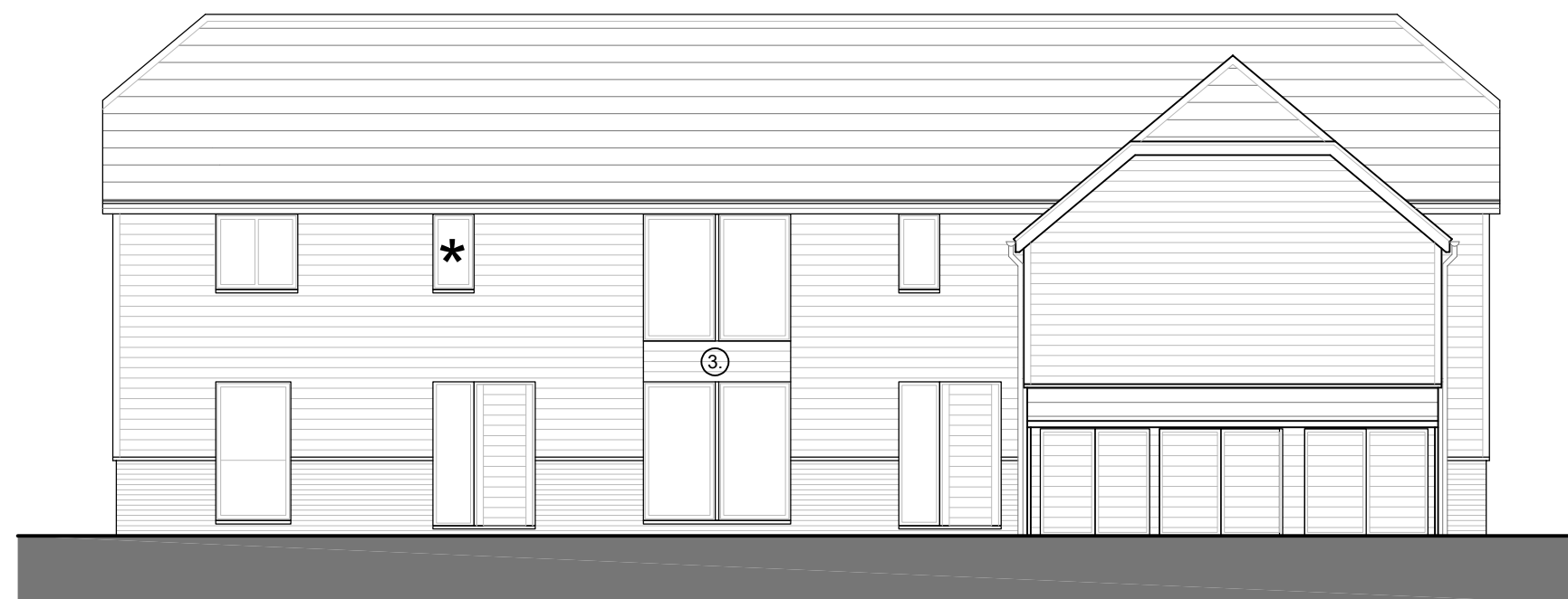
PROPOSED EAST ELEVATION UNITS 2, 3 & 4 SCALE 1:100 @ A2