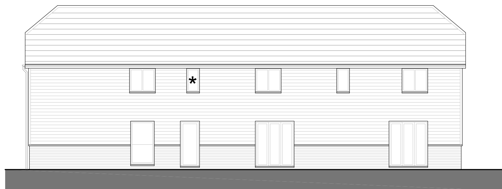
PROPOSED WEST ELEVATION UNITS 2, 3 & 4 SCALE 1:100 @ A2