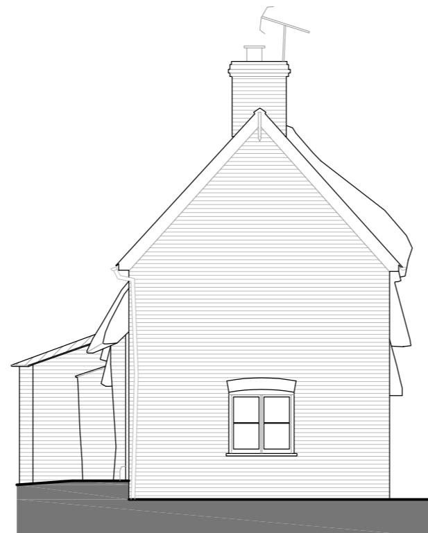
PROPOSED SOUTH ELEVATION UNIT 1 SCALE 1:100 @ A3