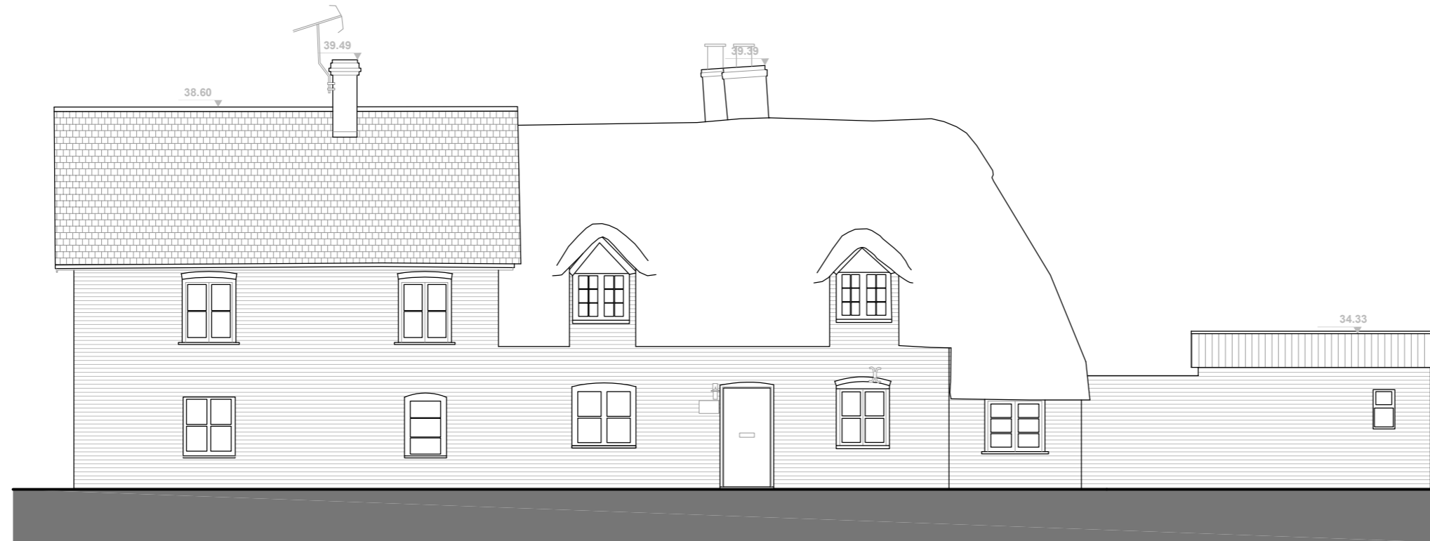
PROPOSED EAST ELEVATION UNIT 1 SCALE 1:100 @ A3