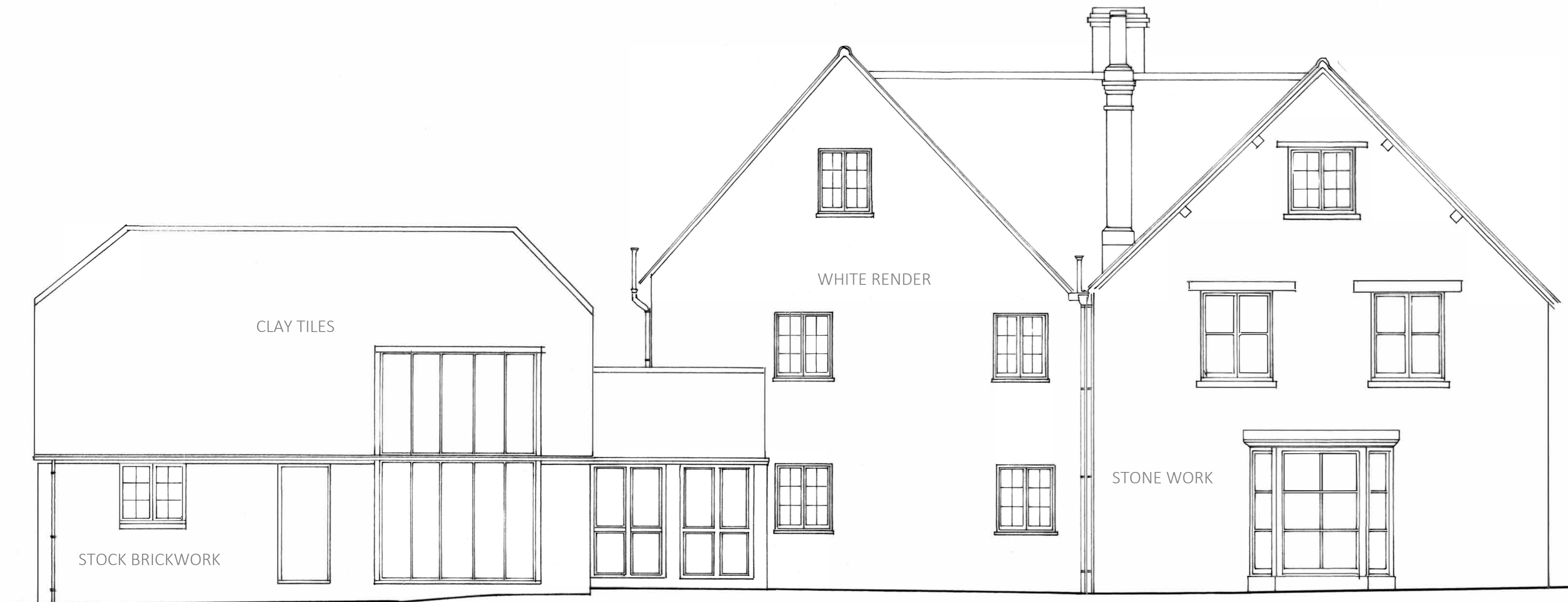
EXISTING WEST ELEVATION 1:50