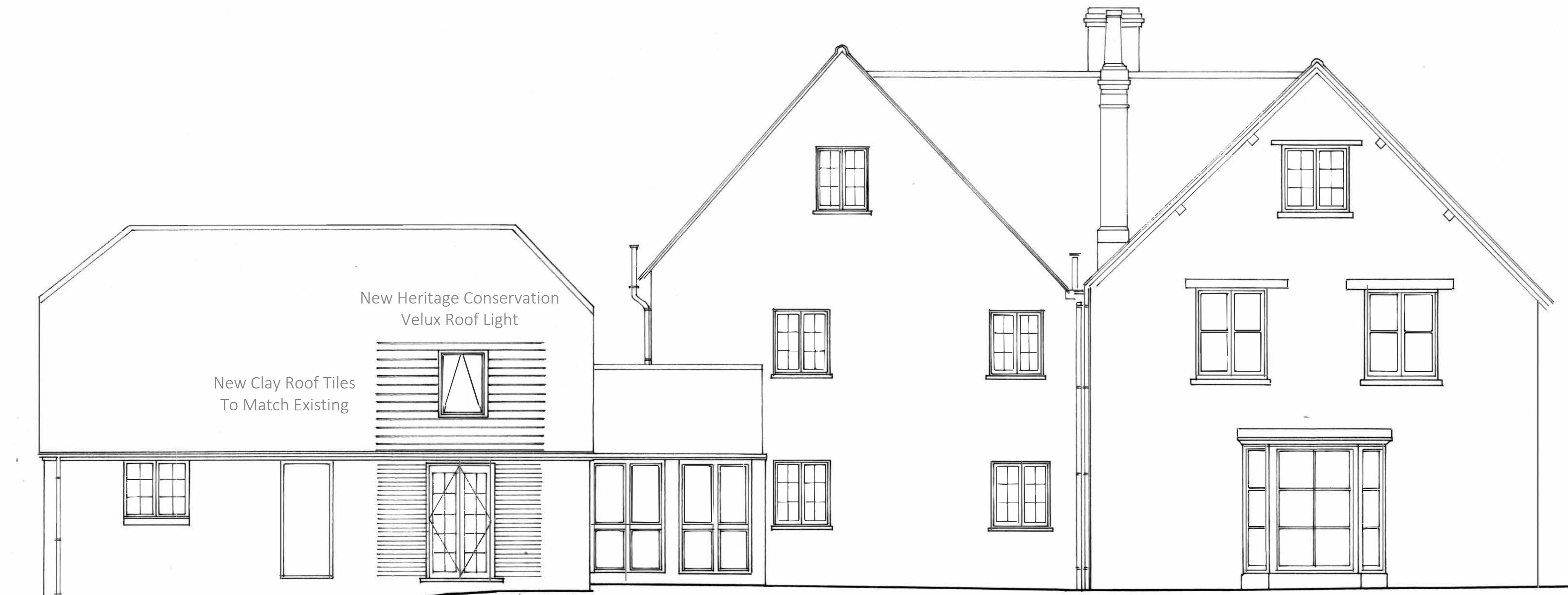
PROPOSED WEST ELEVATION 1:50