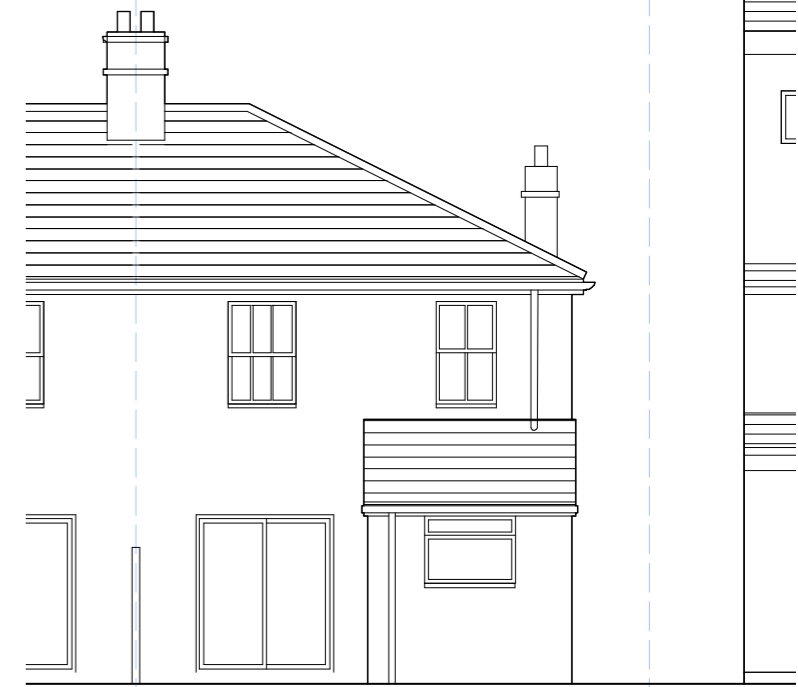
Existing rear elevation Scale 1:100