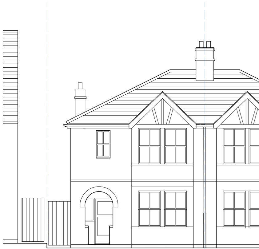
Existing front elevation (Glanville Road) Scale 1:100