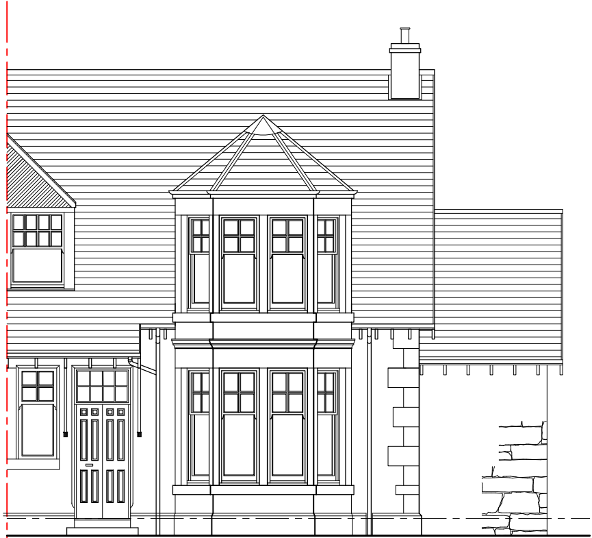
NORTH EAST ELEVATION AS EXISTING 1:100