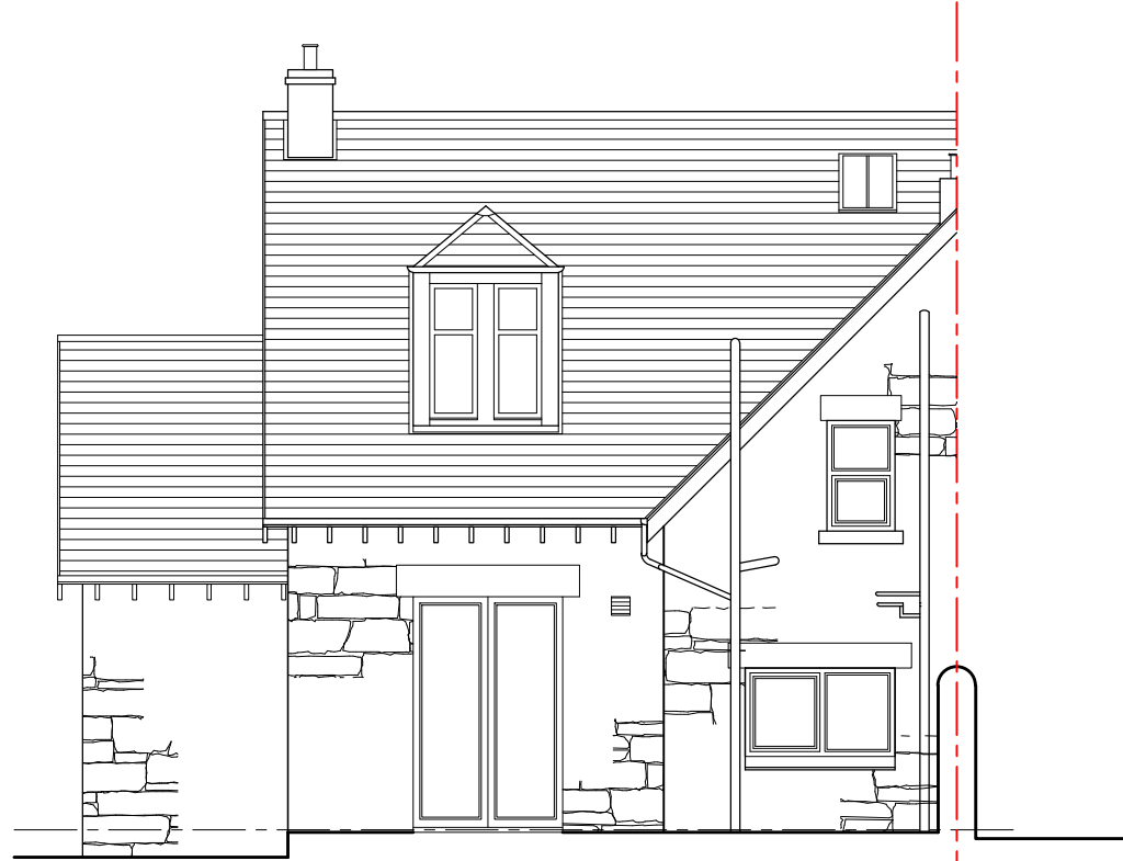
SOUTH WEST ELEVATION AS EXISTING 1:100