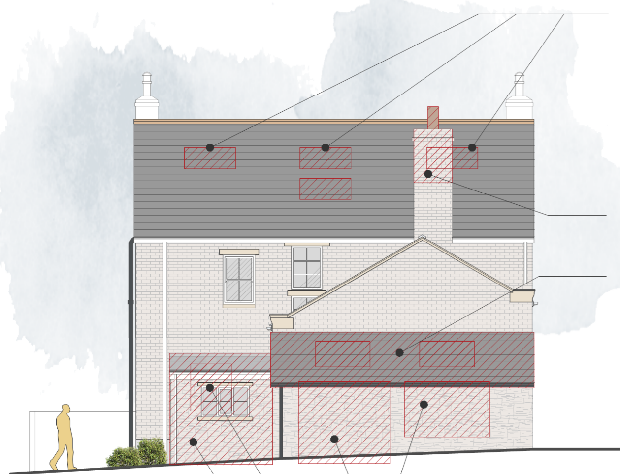
4 West Elevation Scale: 1:100