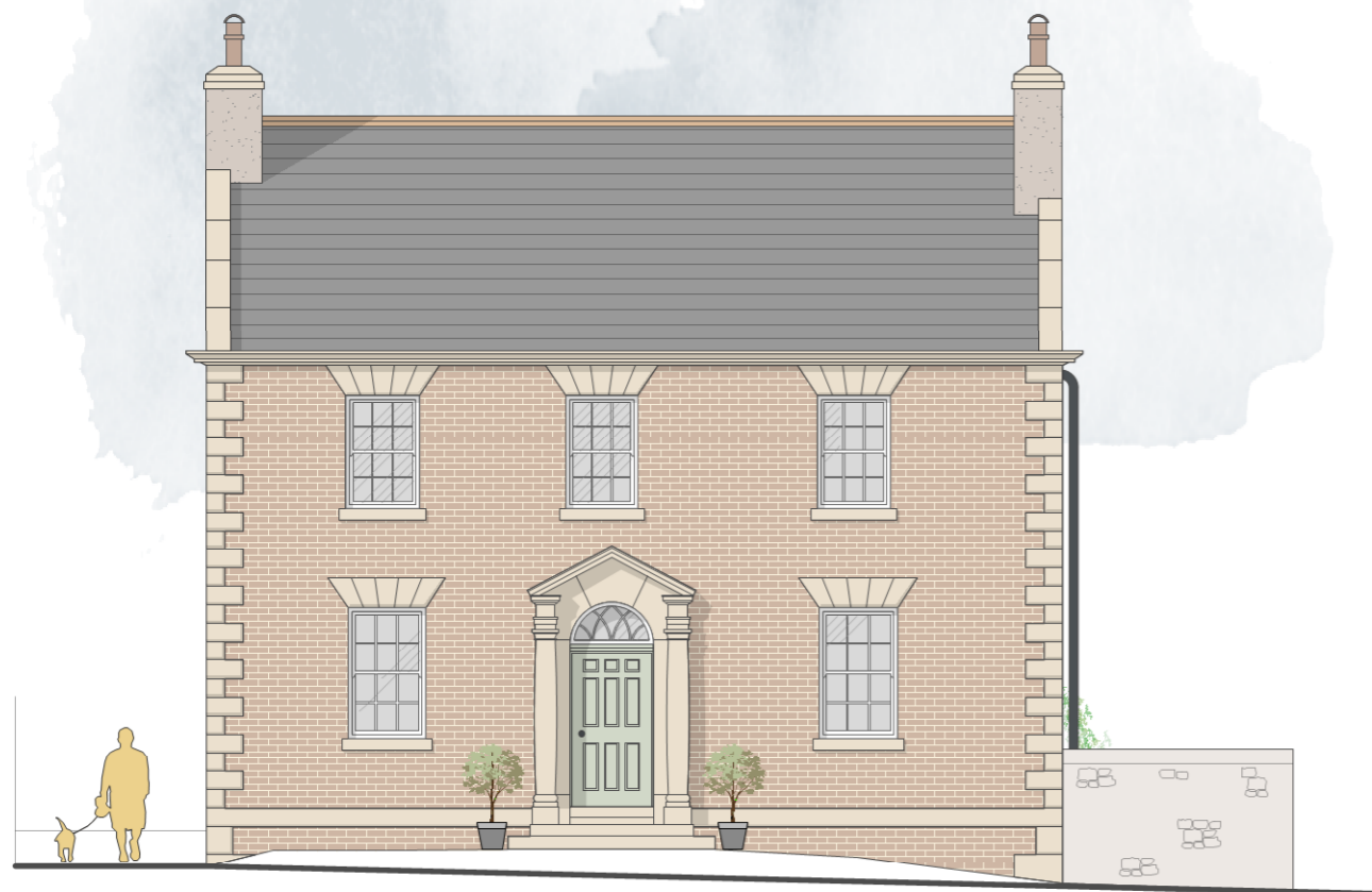
1 East Elevation Scale: 1:100