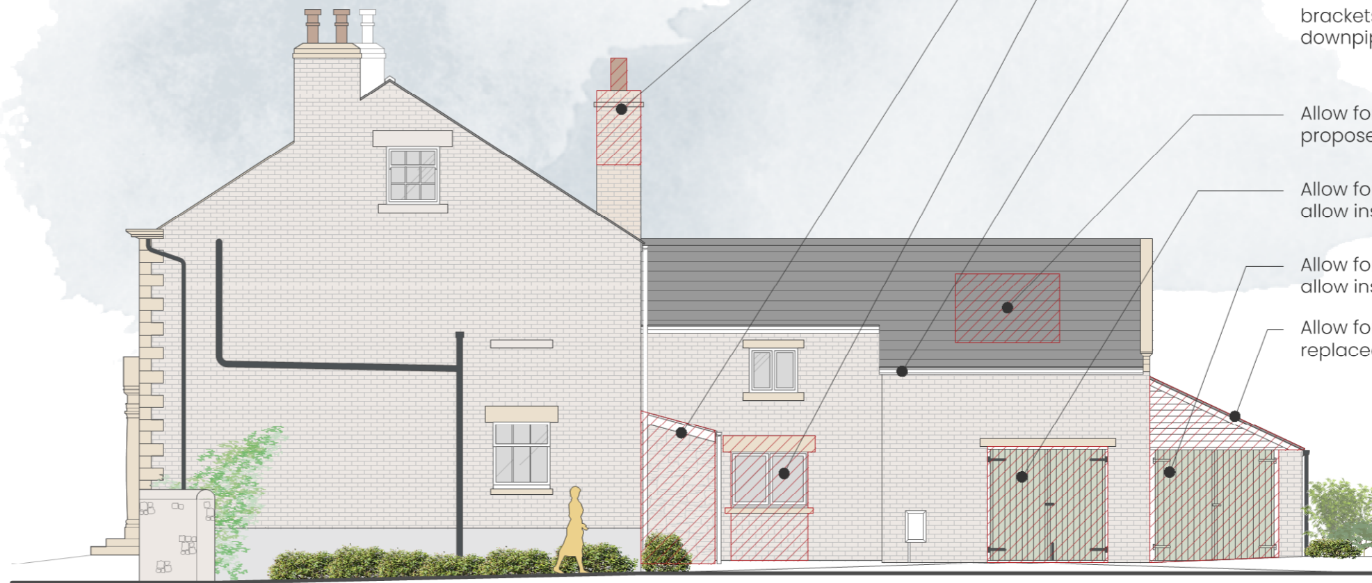
2 North Elevation Scale: 1:100