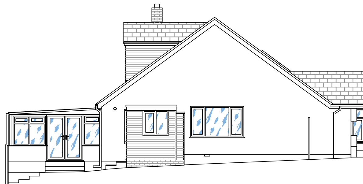
EXISTING SIDE ELEVATION 2