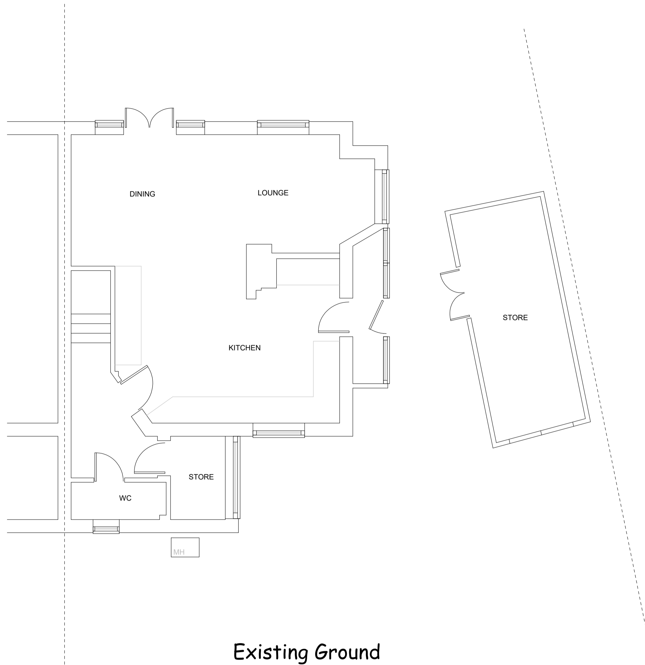
Existing Ground Floor (1:50)