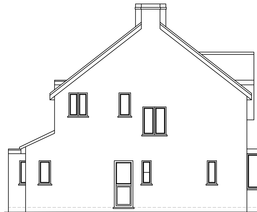
EXISTING ELEVATION SIDE B SCALE 1:100