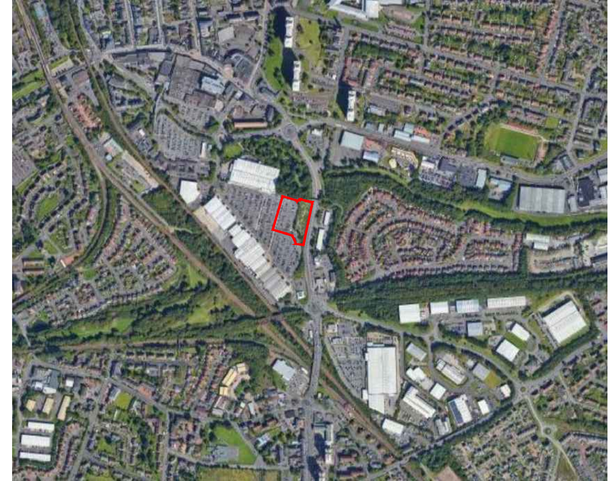
LOCALITY PLAN | NTS