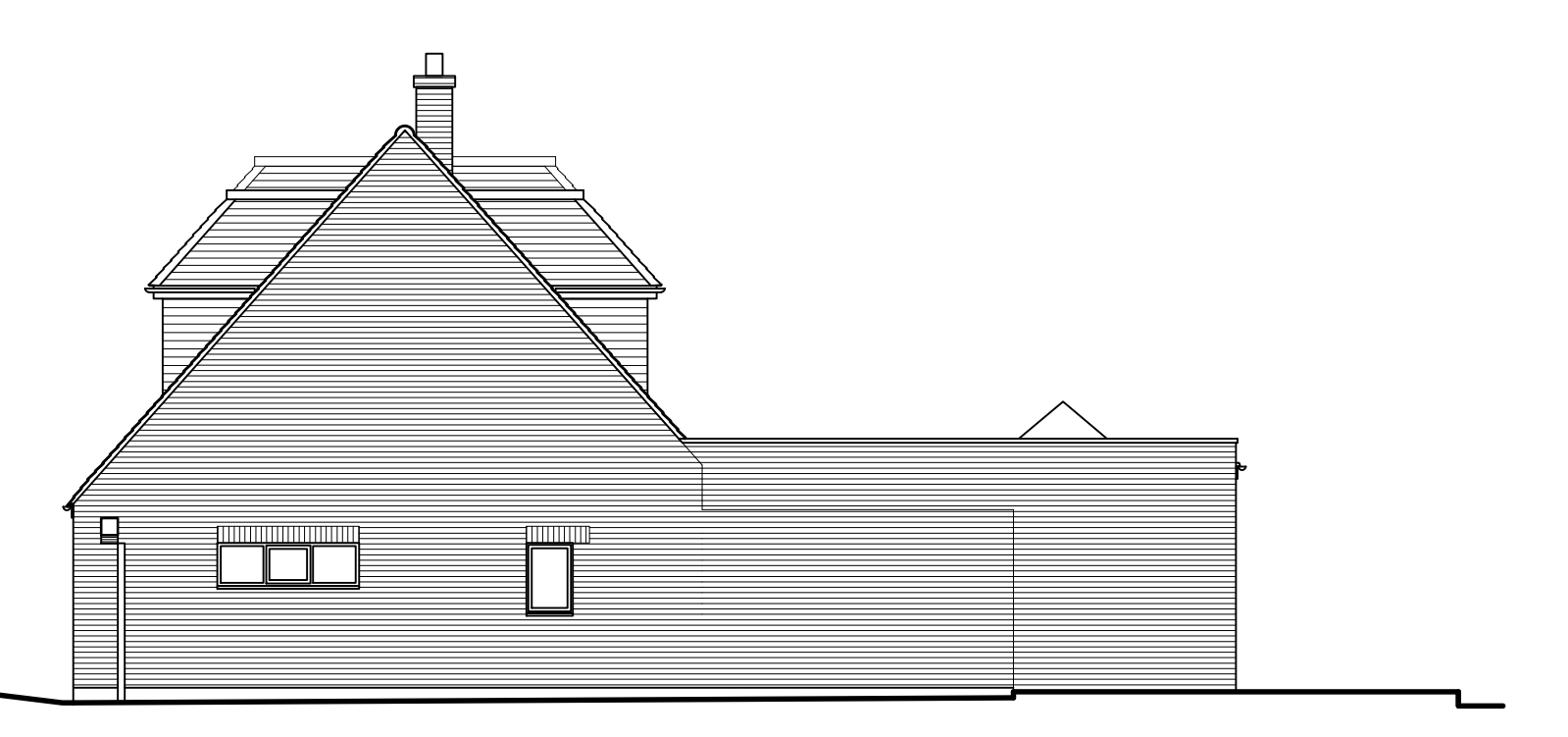
SIDE ELEVATION (Viewed from no.233)