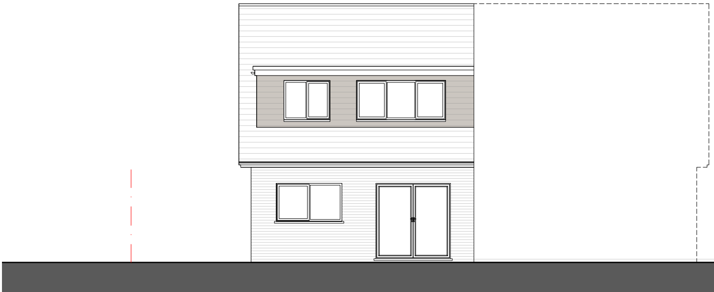
Existing Rear Elevation - 1:100