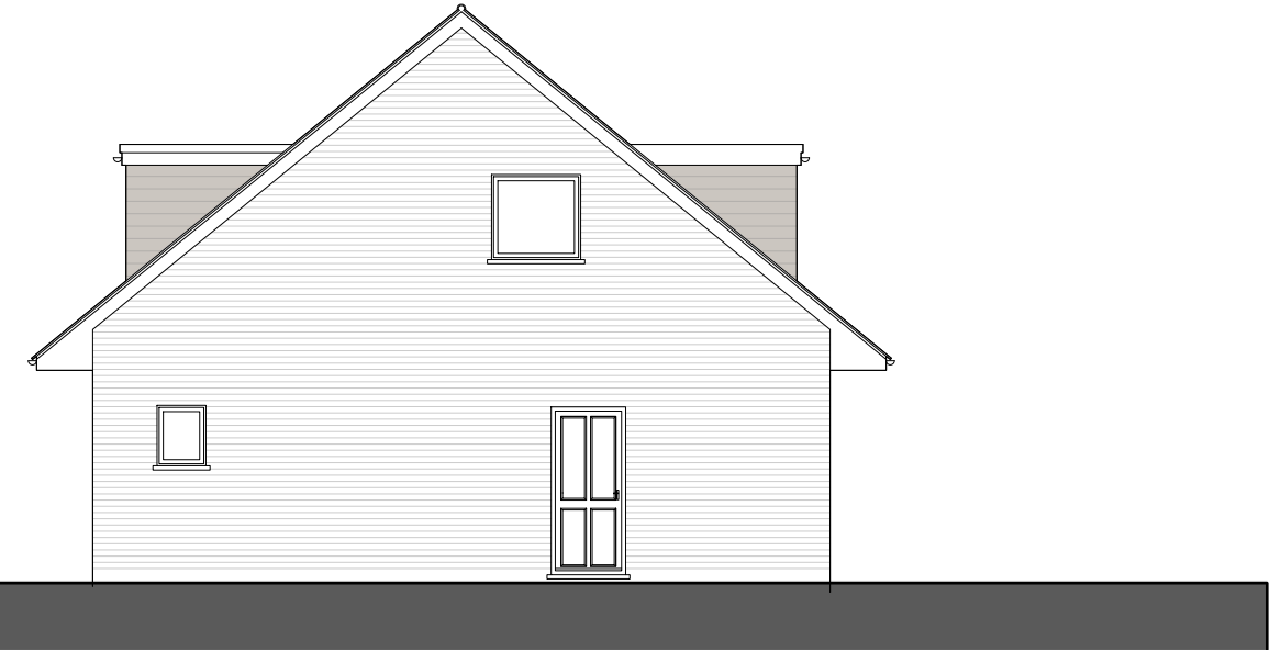
Existing Side Elevation - 1:100