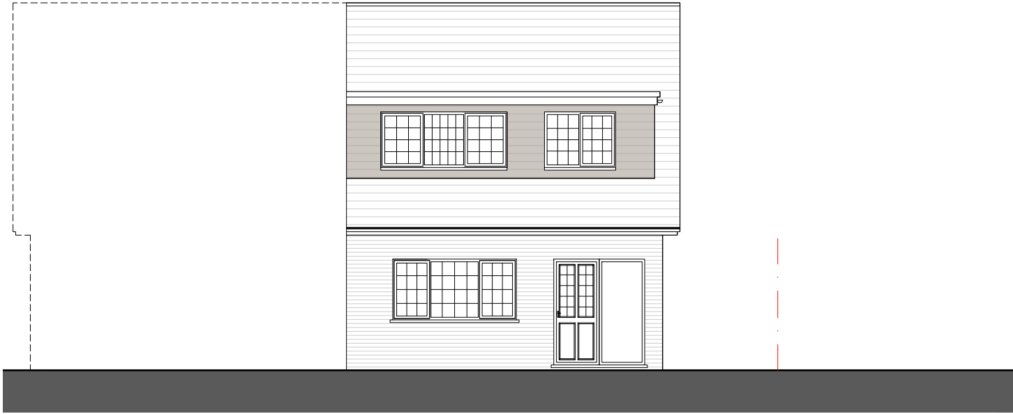
Existing Front Elevation - 1:100