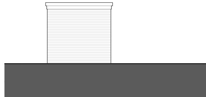
Existing Rear Elevation - 1:100