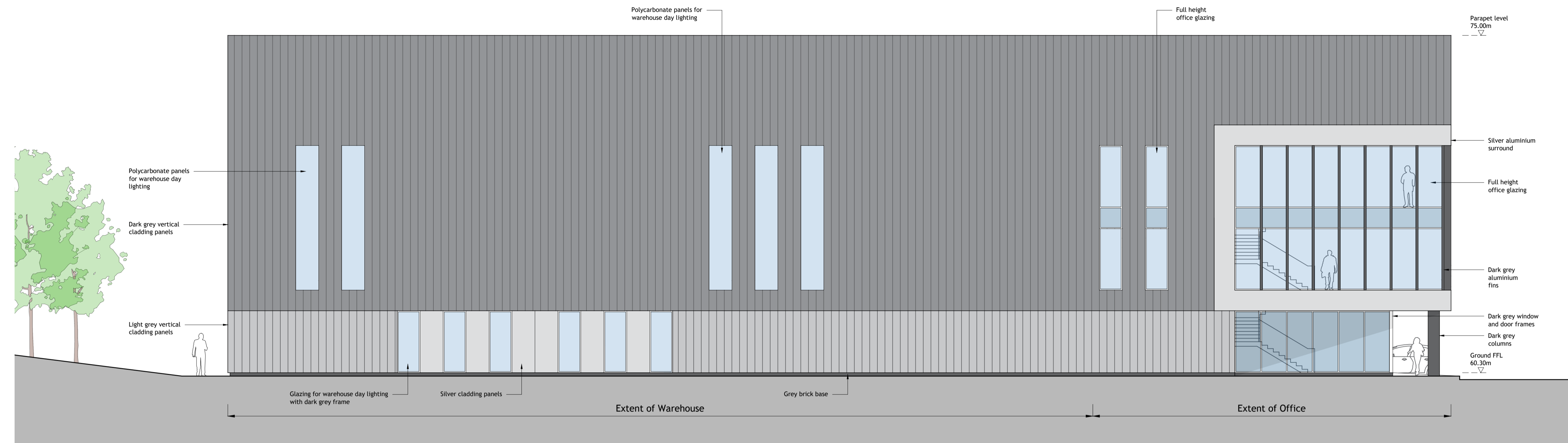
Proposed North East Elevation - Along Wokingham Road SCALE 1:100