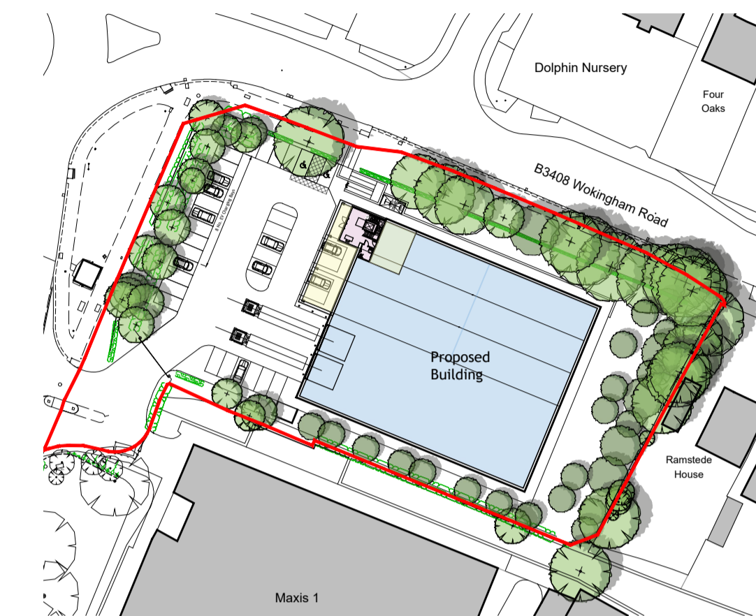
KEY PLAN SCALE 1:1000