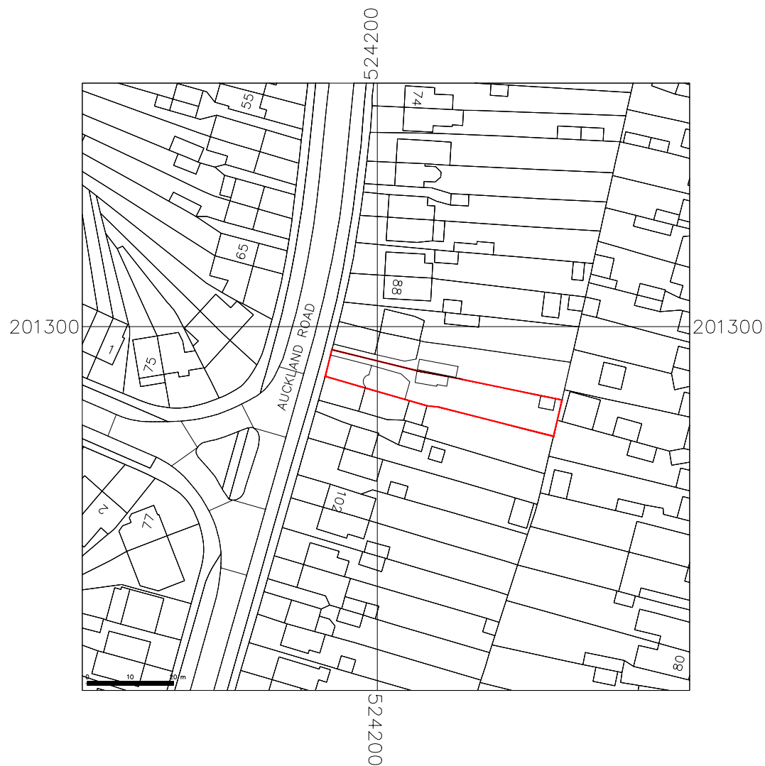
LOCATION PLAN @ 1:1250 SCALE