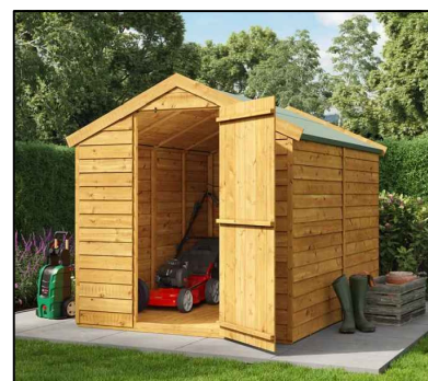
EXAMPLE OF BIKE/GARDEN STORE