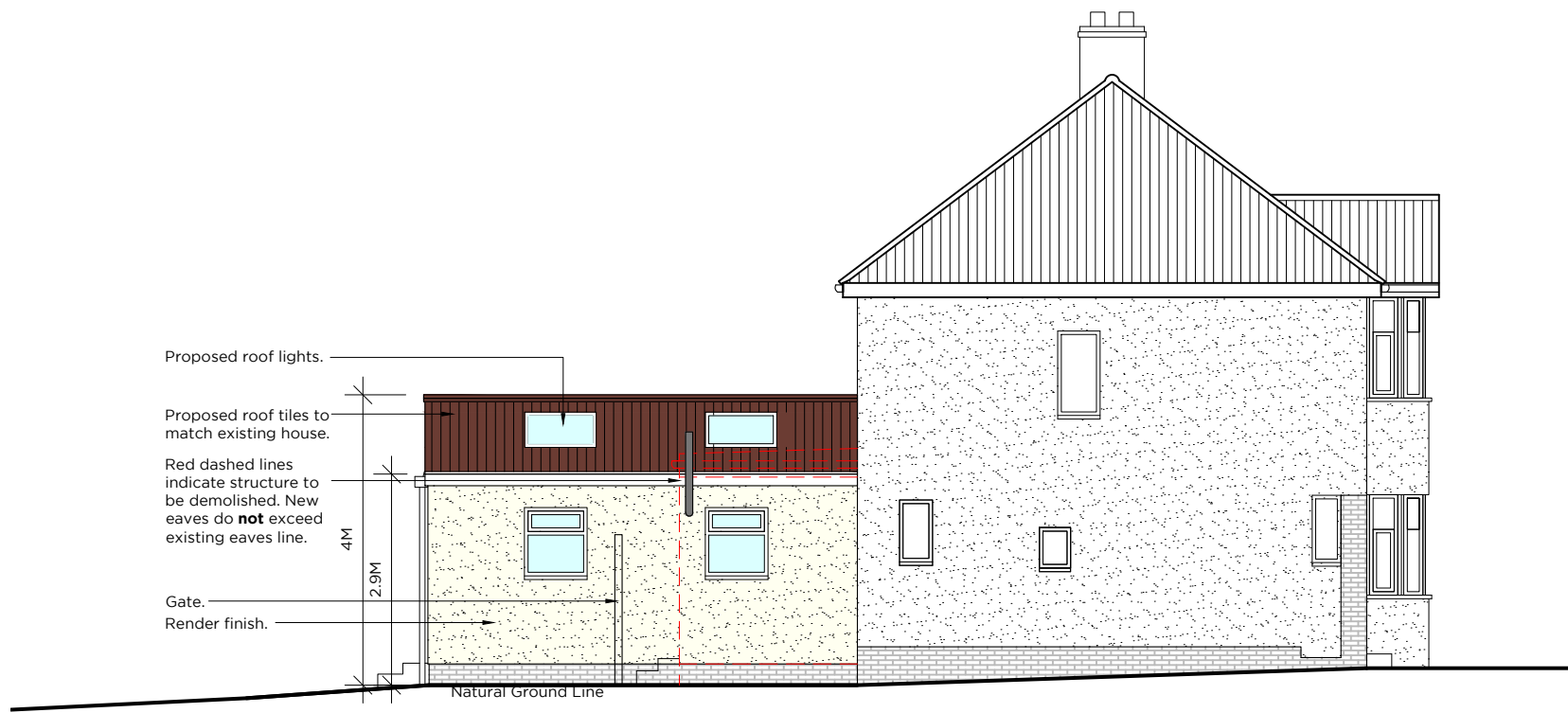
PROPOSED SIDE (NORTH) ELEVATION