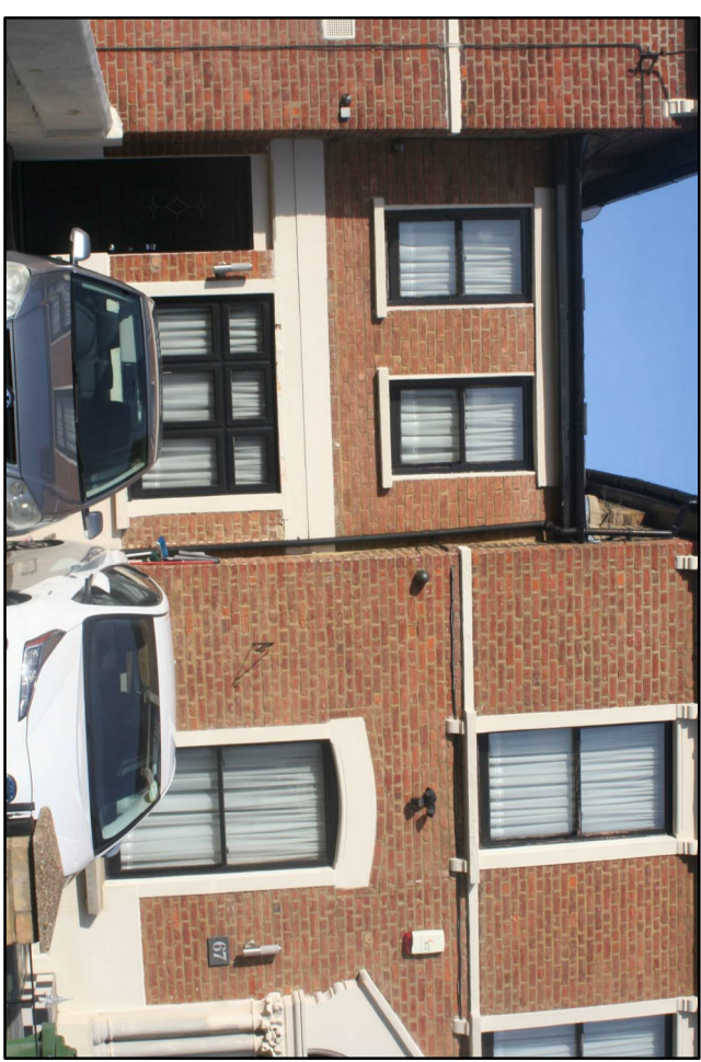
EXISTING PHOTO Existing