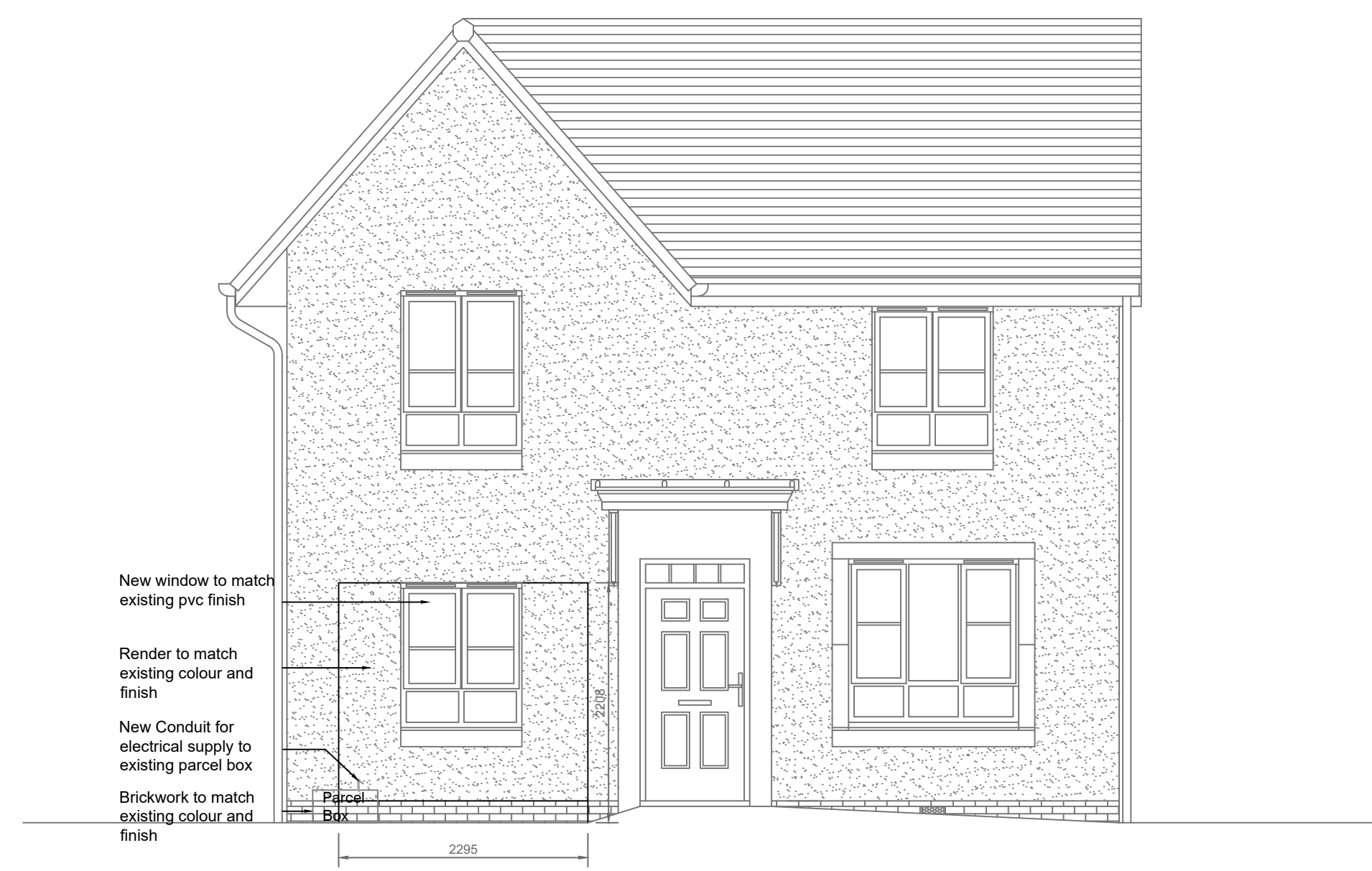
Proposed Elevations 1:50 @ A1