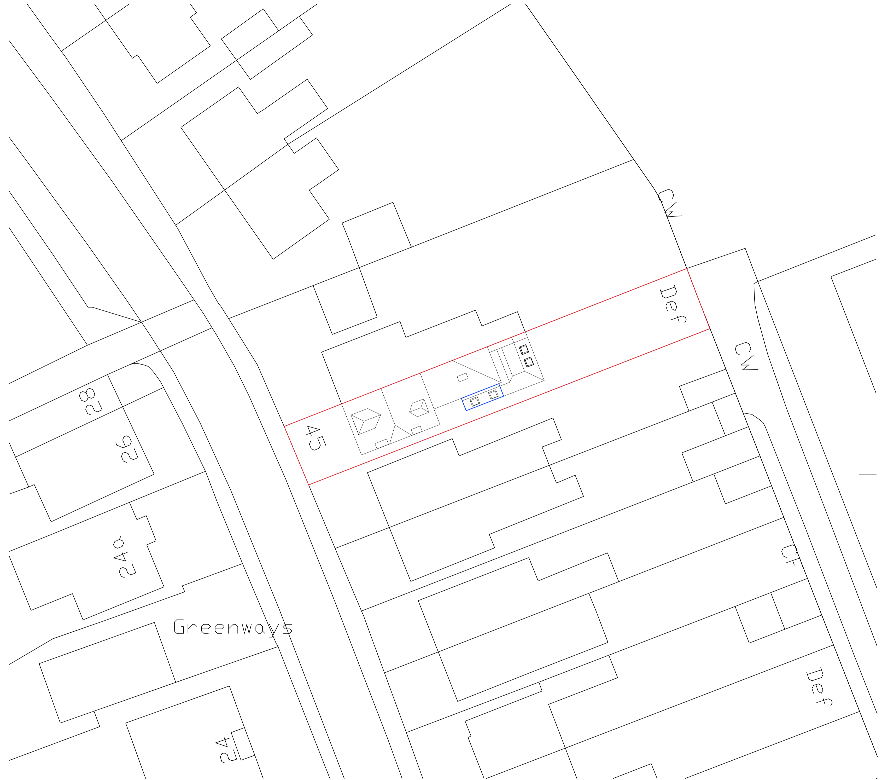
1 Block Plan Scale: 1:200