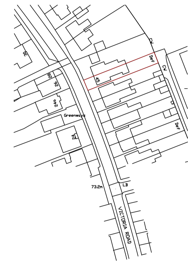
1 Location Plan Scale: 1:1250