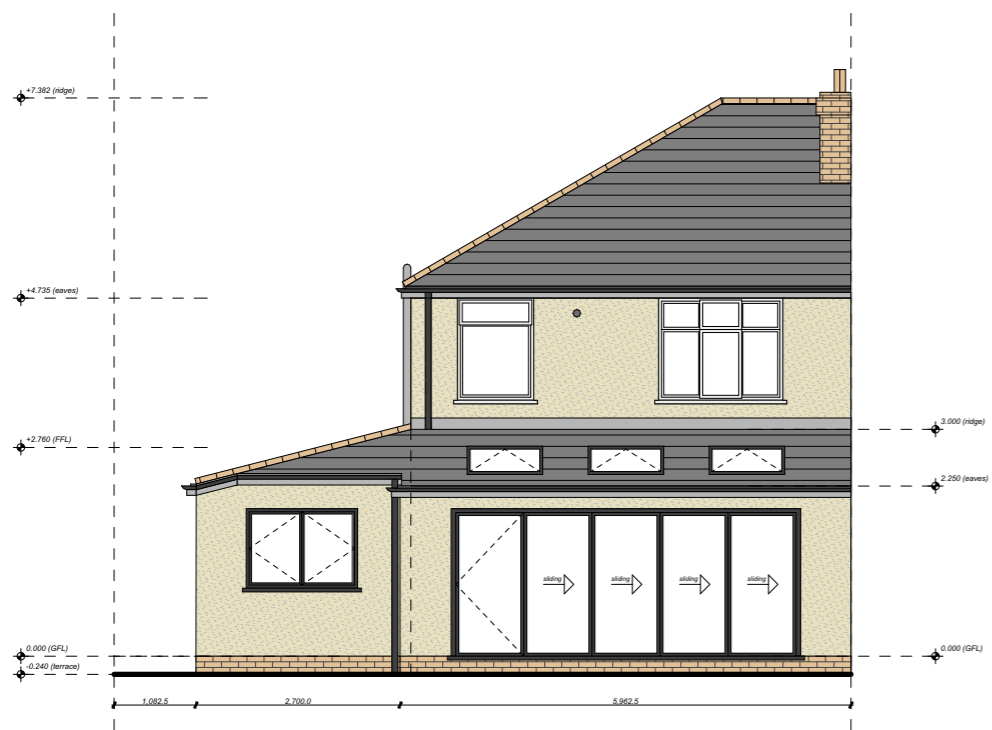
REAR ELEVATION (SOUTH)