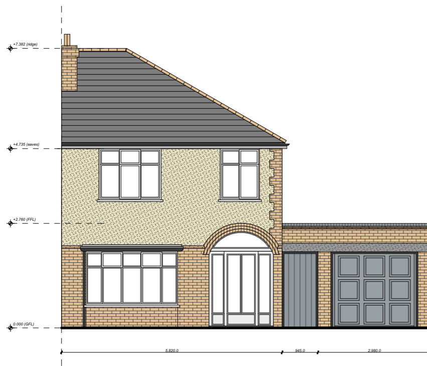
FRONT ELEVATION (NORTH)