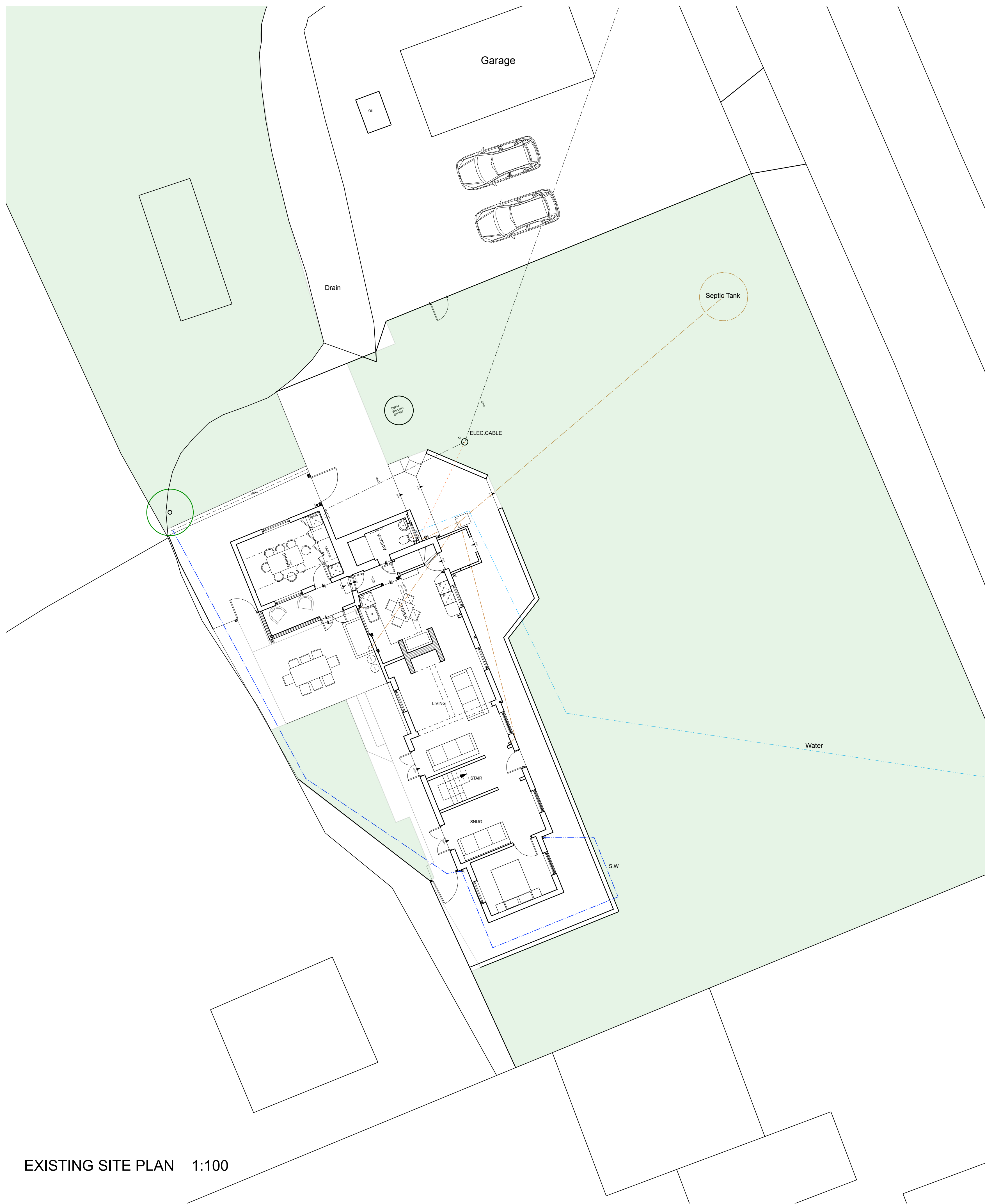
EXISTING SITE PLAN 1:100

General Notes 1. Do not scale this drawing. All dimensions to be as noted. Contractor to check all dimensions on site before carry out works. 2. This drawing is for the private and confidential use of the client for whom it was undertaken and it should not be reproduced in whole or in part or relied upon by third parties for any use without the express written authority of Beech Architects Limited.