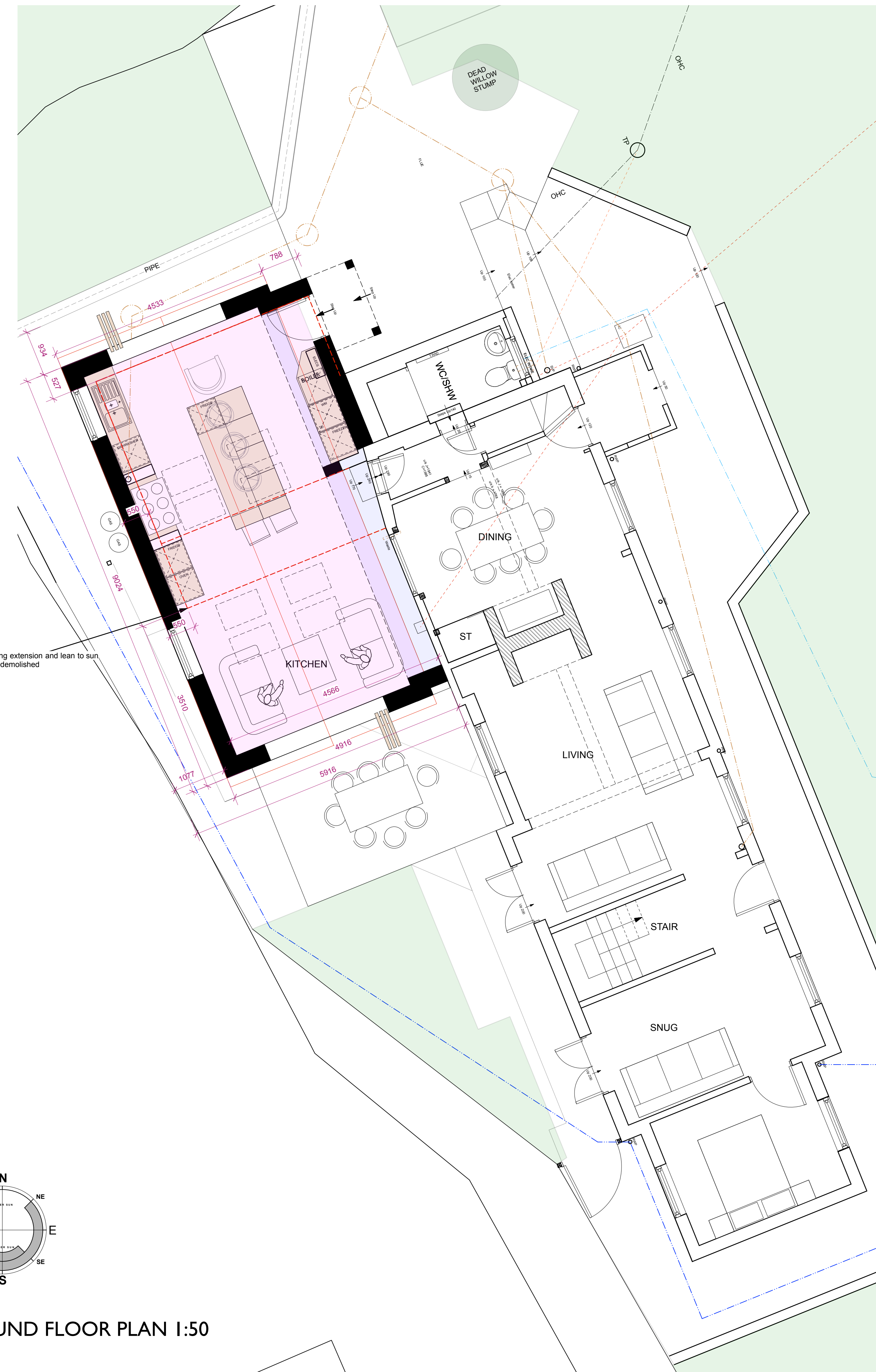
GROUND FLOOR PLAN 1:50

General Notes 1. Do not scale this drawing. All dimensions to be as noted. Contractor to check all dimensions on site before carry out works. 2. This drawing is for the private and confidential use of the client for whom it was undertaken and it should not be reproduced in whole or in part or relied upon by third parties for any use without the express written authority of Beech Architects Limited.