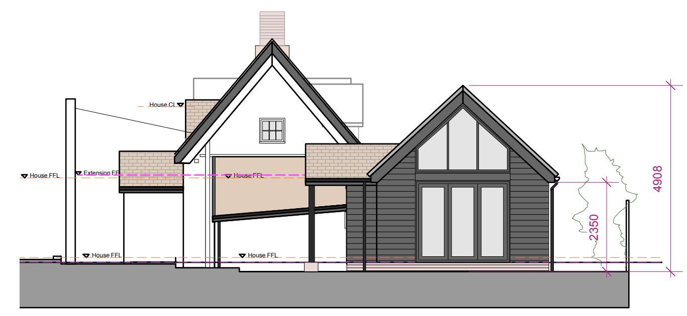
NORTH ELEVATION. 1:100