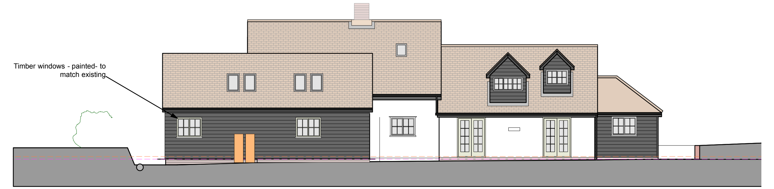
WEST (REAR) ELEVATION

H. 15.01.24 Reduced scheme - demo note removed G. 13.01.24 Reduced scheme - gable glazing reinstated F. 02.01.24 Reduced scheme - Following client msg E. 23.01.23 Updated for planning D. 20.01.23 Clms added C. 17.01.23 Updated from client comments B. 16.01.23 Updated for planning A. 09.12.22 Updated with two storey element Rev