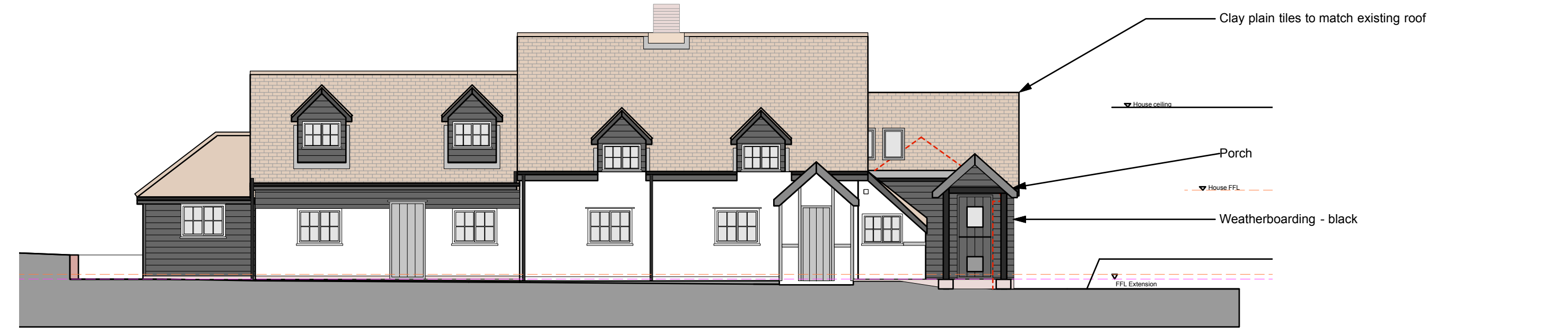
EAST (FRONT) ELEVATION 1:100