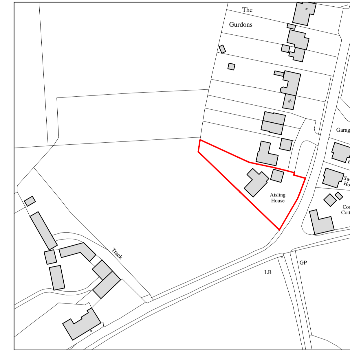
Location Plan Scale: 1:1250