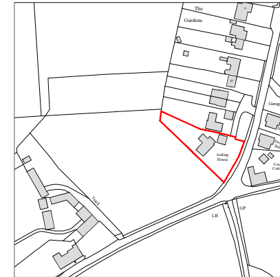
Location Plan Scale: 1:1250