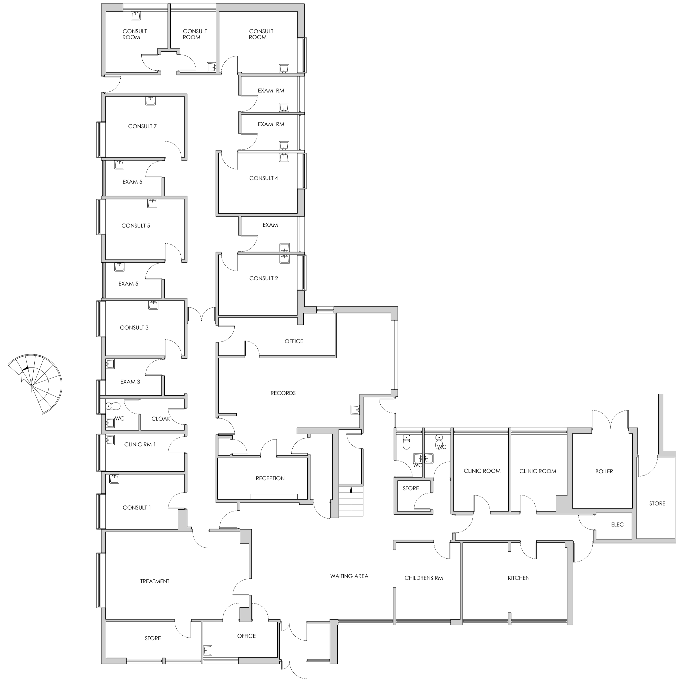
EXISTING GROUND FLOOR PLAN SCALE 1:100