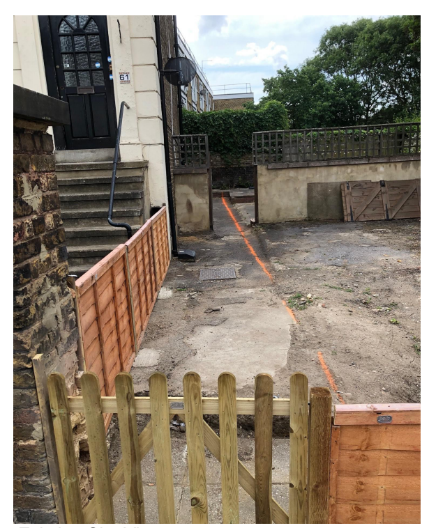
Existing Site View