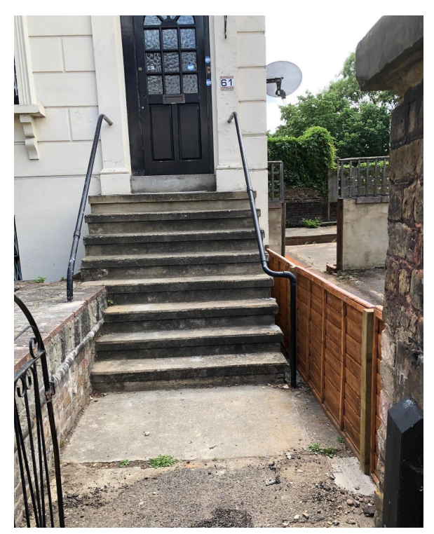
61 Marischal Road Main Entrance View