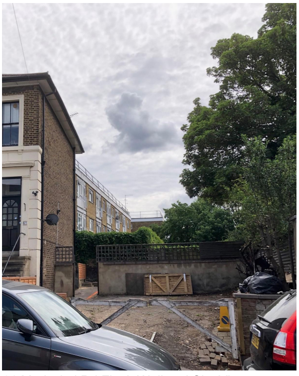
61 Marischal Rd Flank Wall and Site View