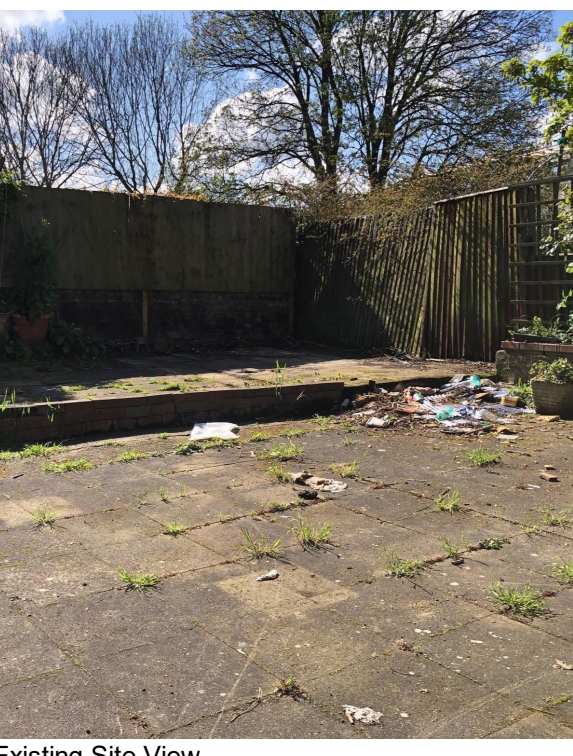
Existing Site View