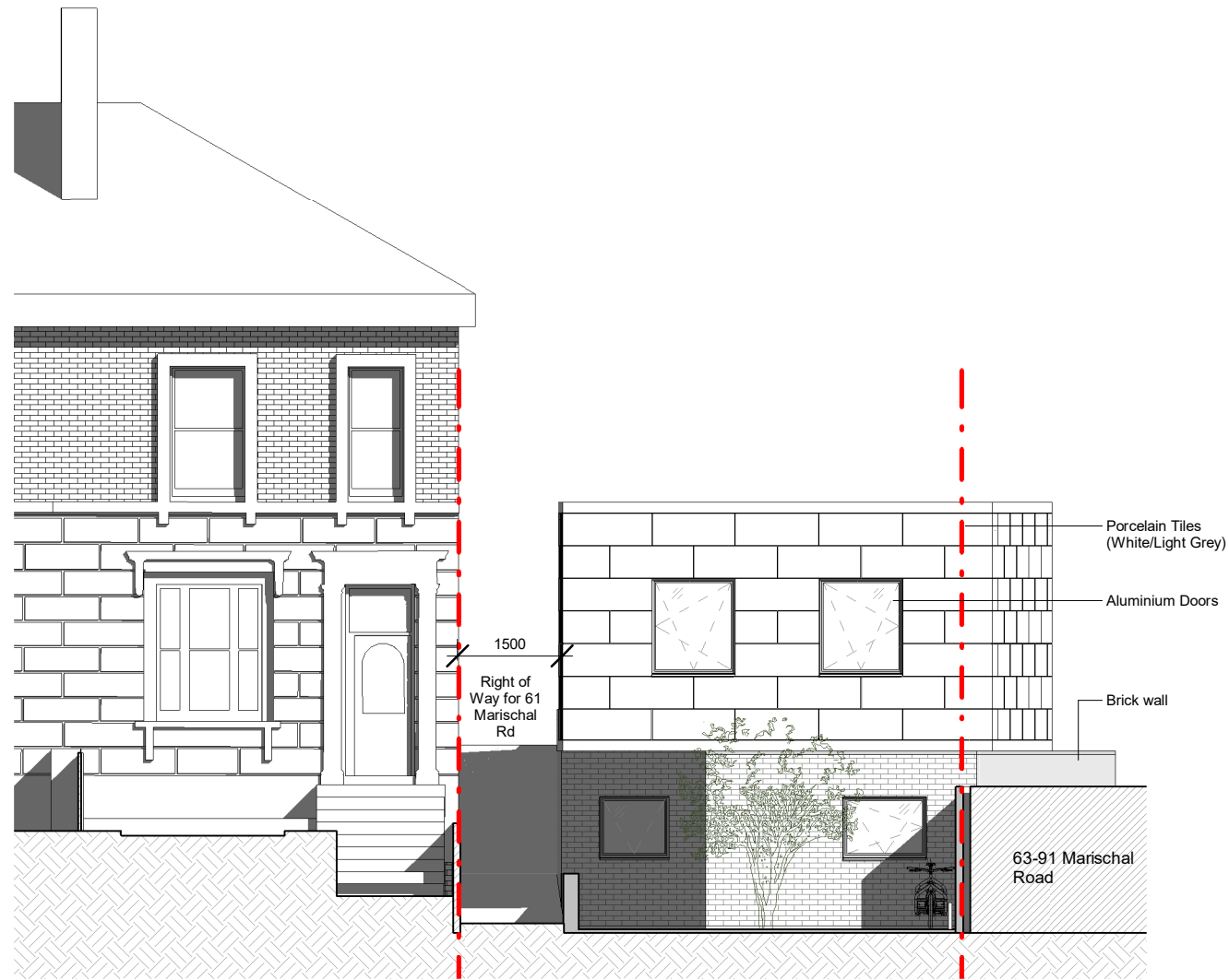
1 Northwest Elevation 1 : 100